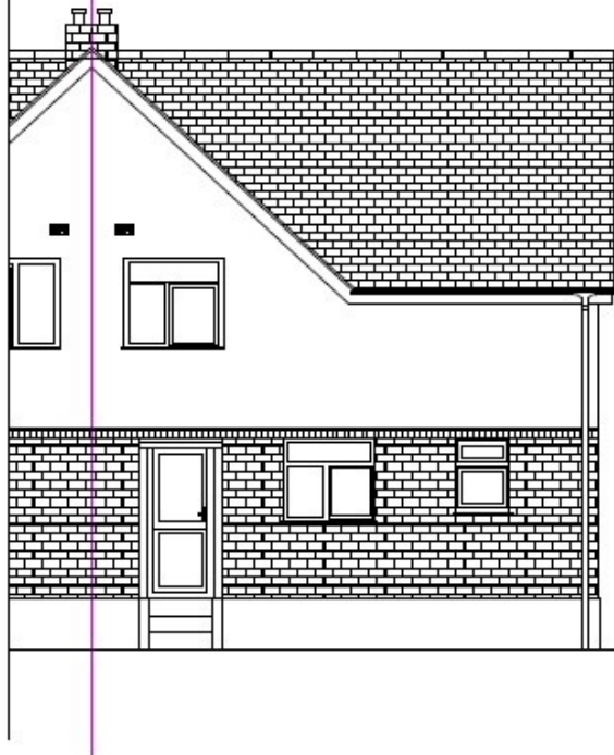
EXISTING REAR ELEVATION PLAN