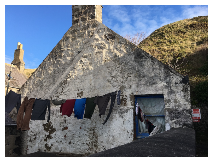
Derelict Cottage Nov 2020