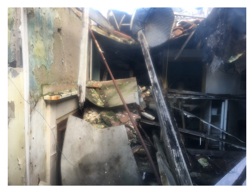
West Gable Nov 2020