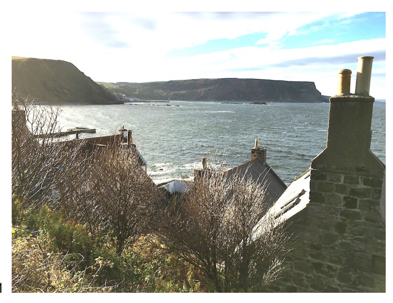
View in through W2 Nov 2020