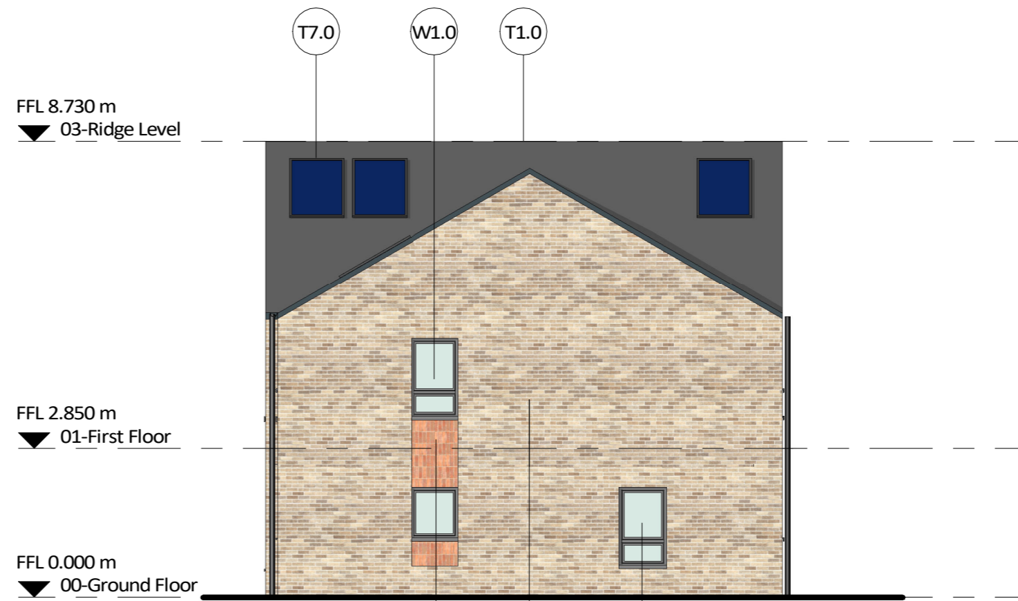
S ELEV 100 1:100