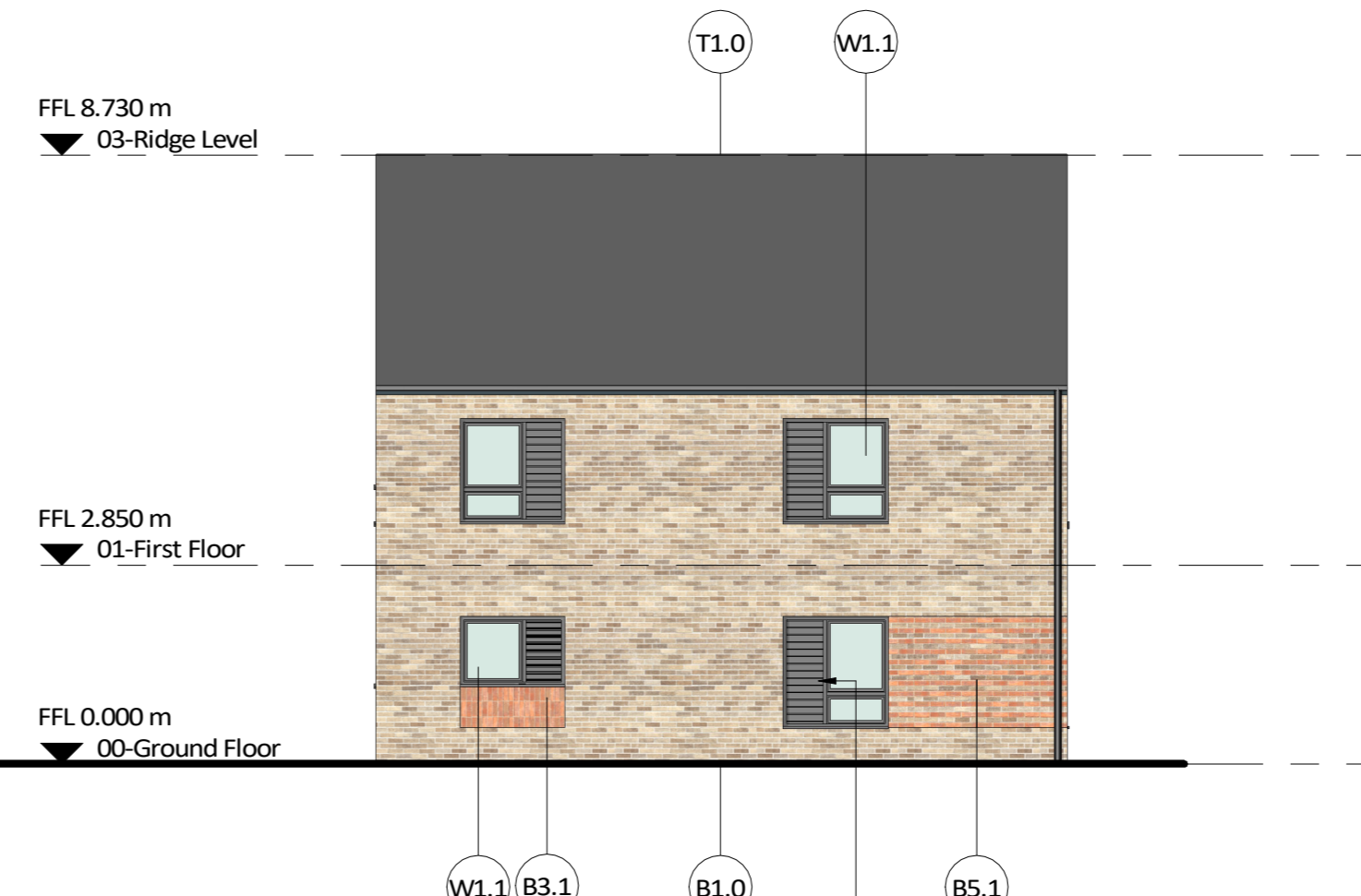
N ELEV 100 1:100