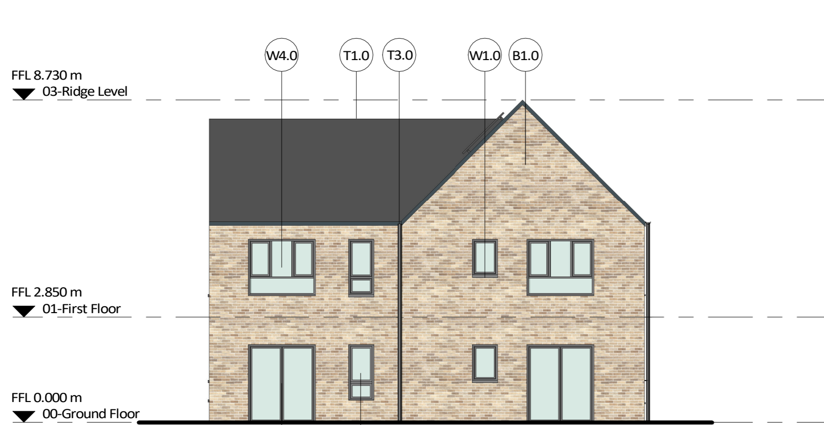
E ELEV 100 1:100