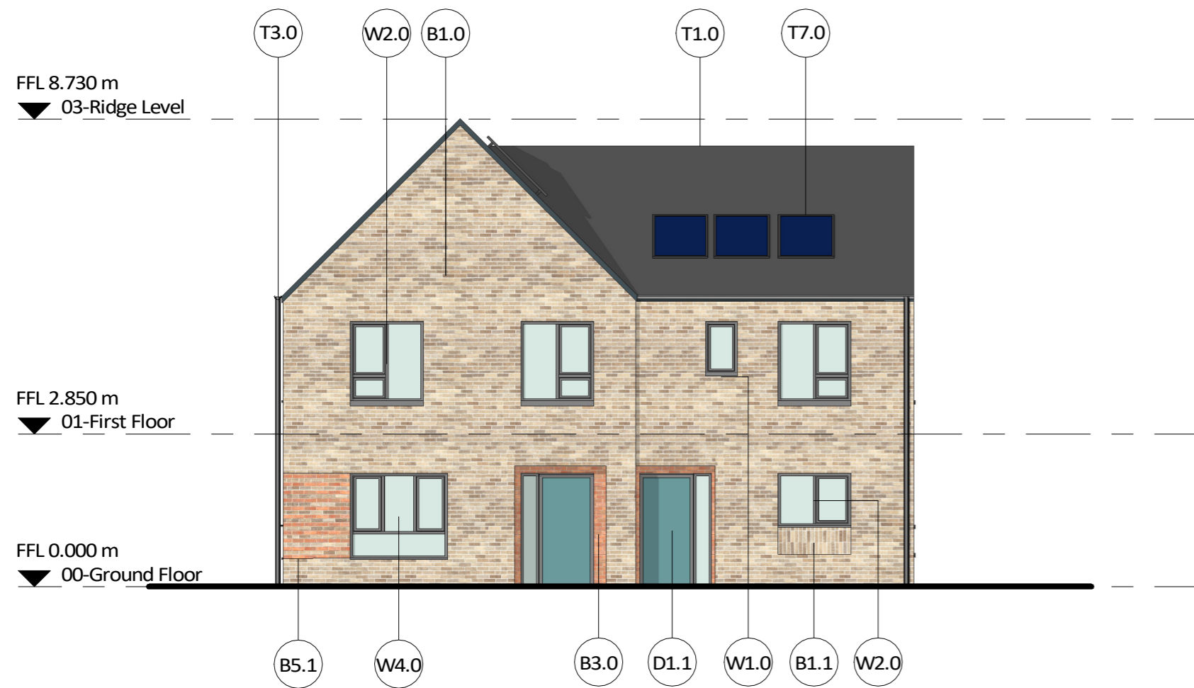
W ELEV 100 1:100