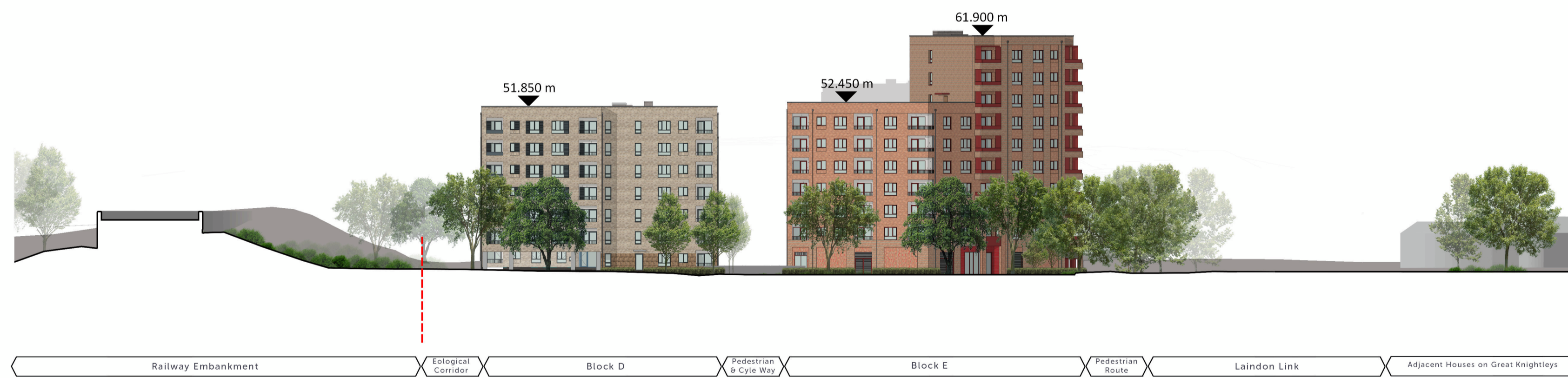
Proposed Site Elevation 05 1:500