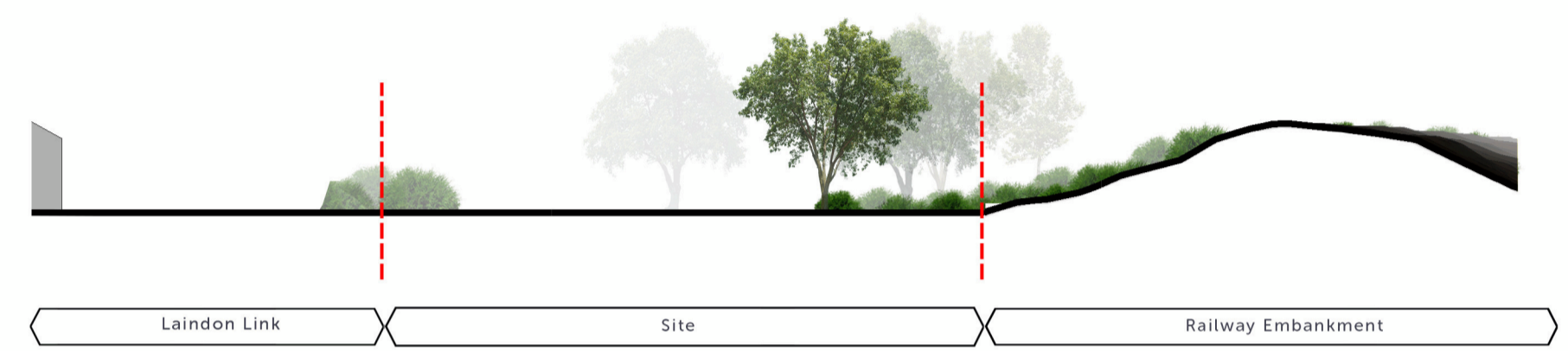
Existing Site Elevation 06 1:500