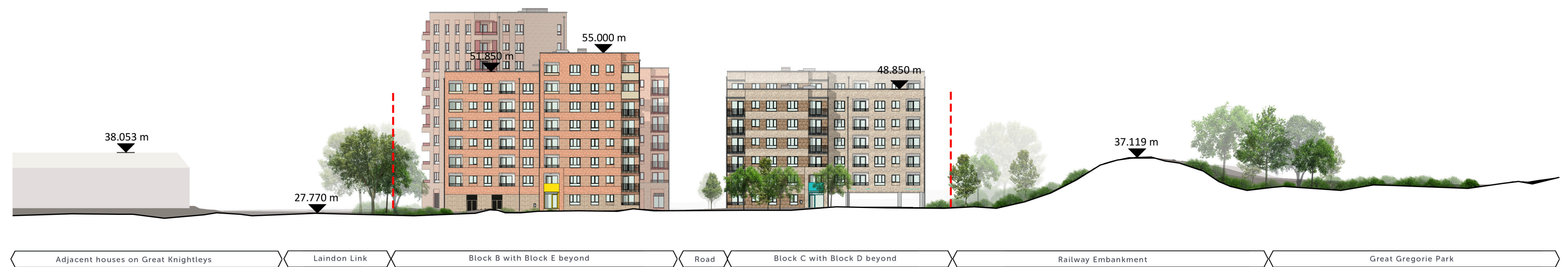
Proposed Site Elevation 01 1:500