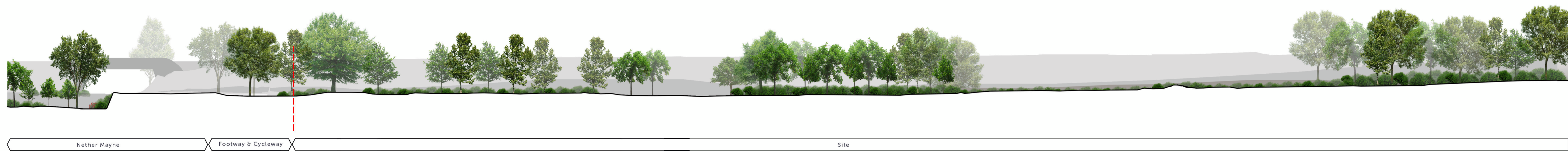
Existing Site Elevation 04 1:500