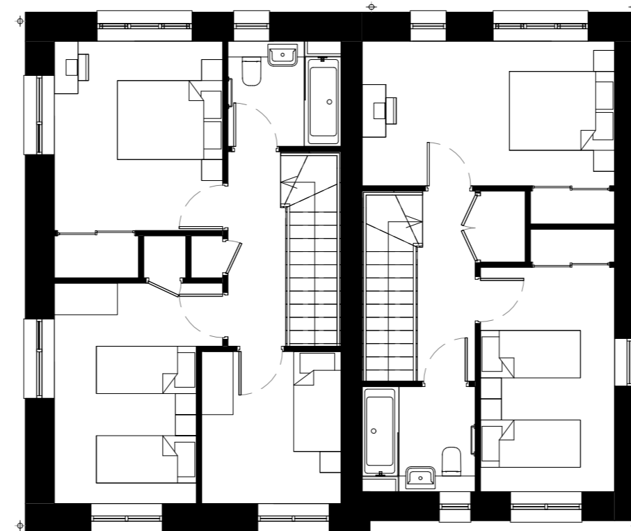
First Floor 1 : 100