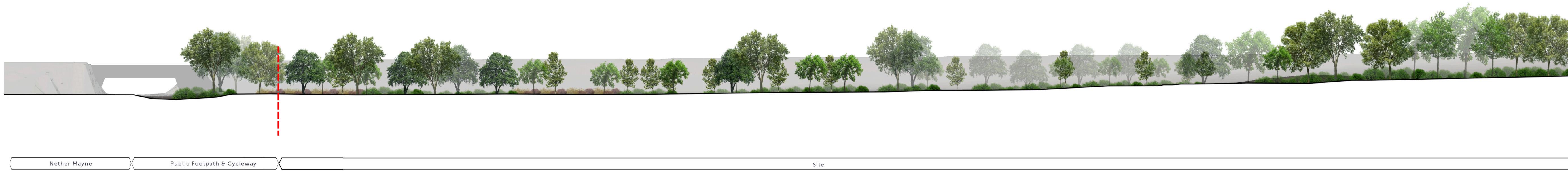
Existing Site Elevation 02 1:500