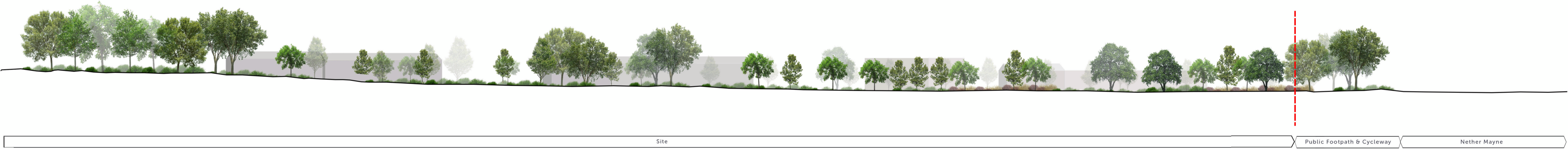
Existing Site Elevation 03 1:500