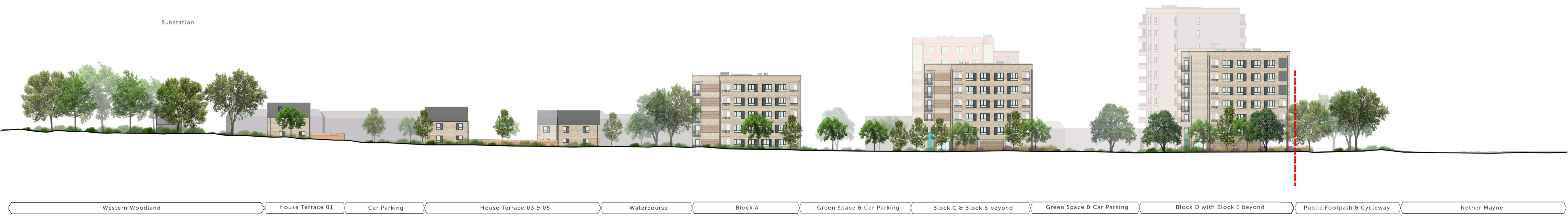
Proposed Site Elevation 03 1:500