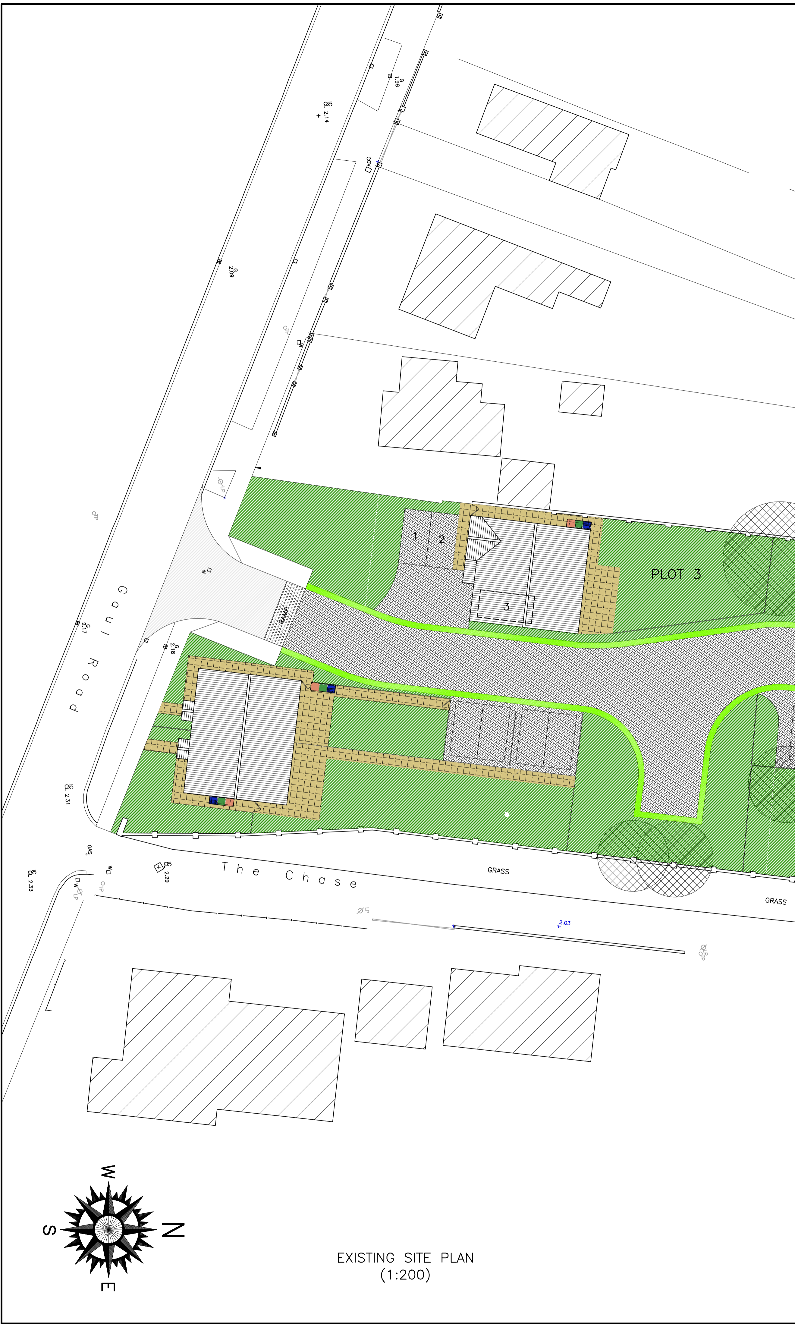
EXISTING SITE PLAN (1:200)