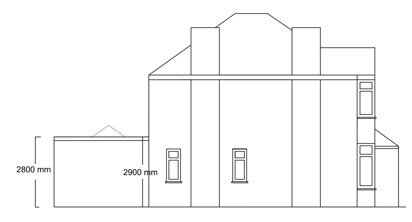
Proposed Side Elevation View From No. 23