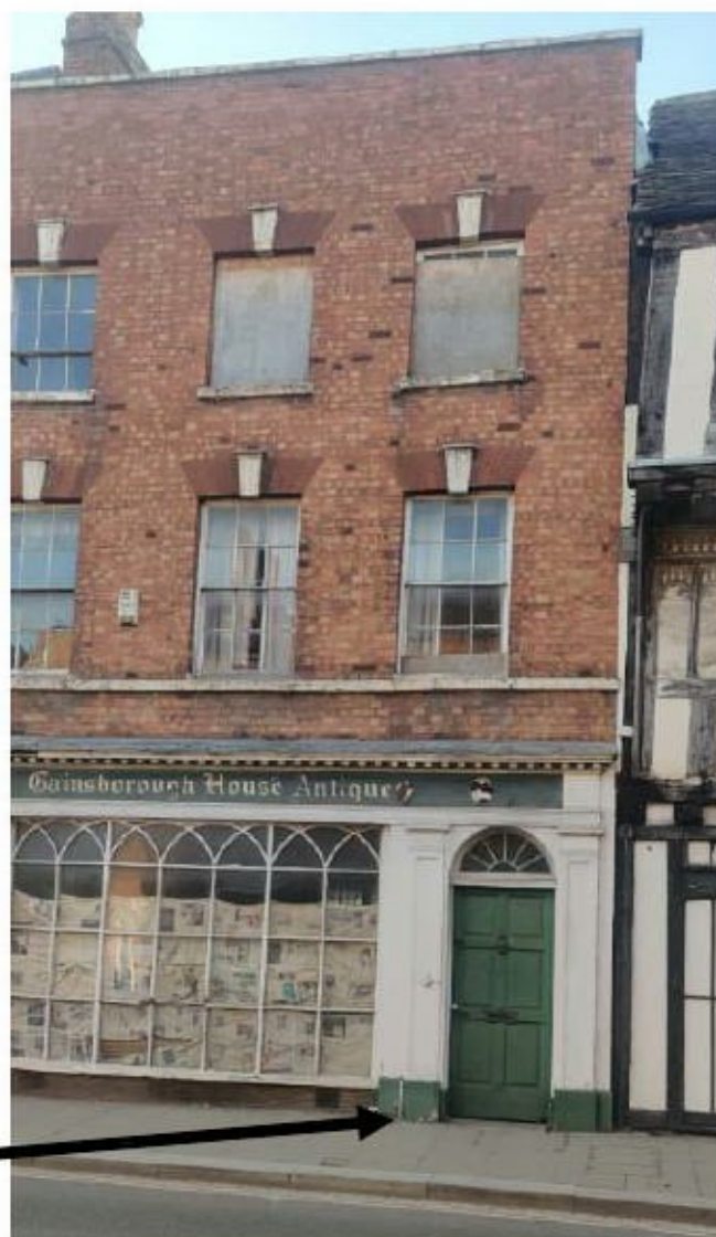
Point of entry from Church Street