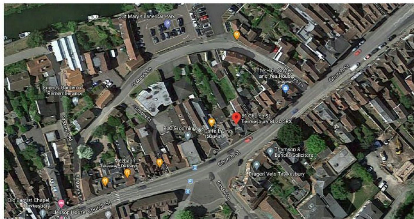
Aerial image highlighting site location