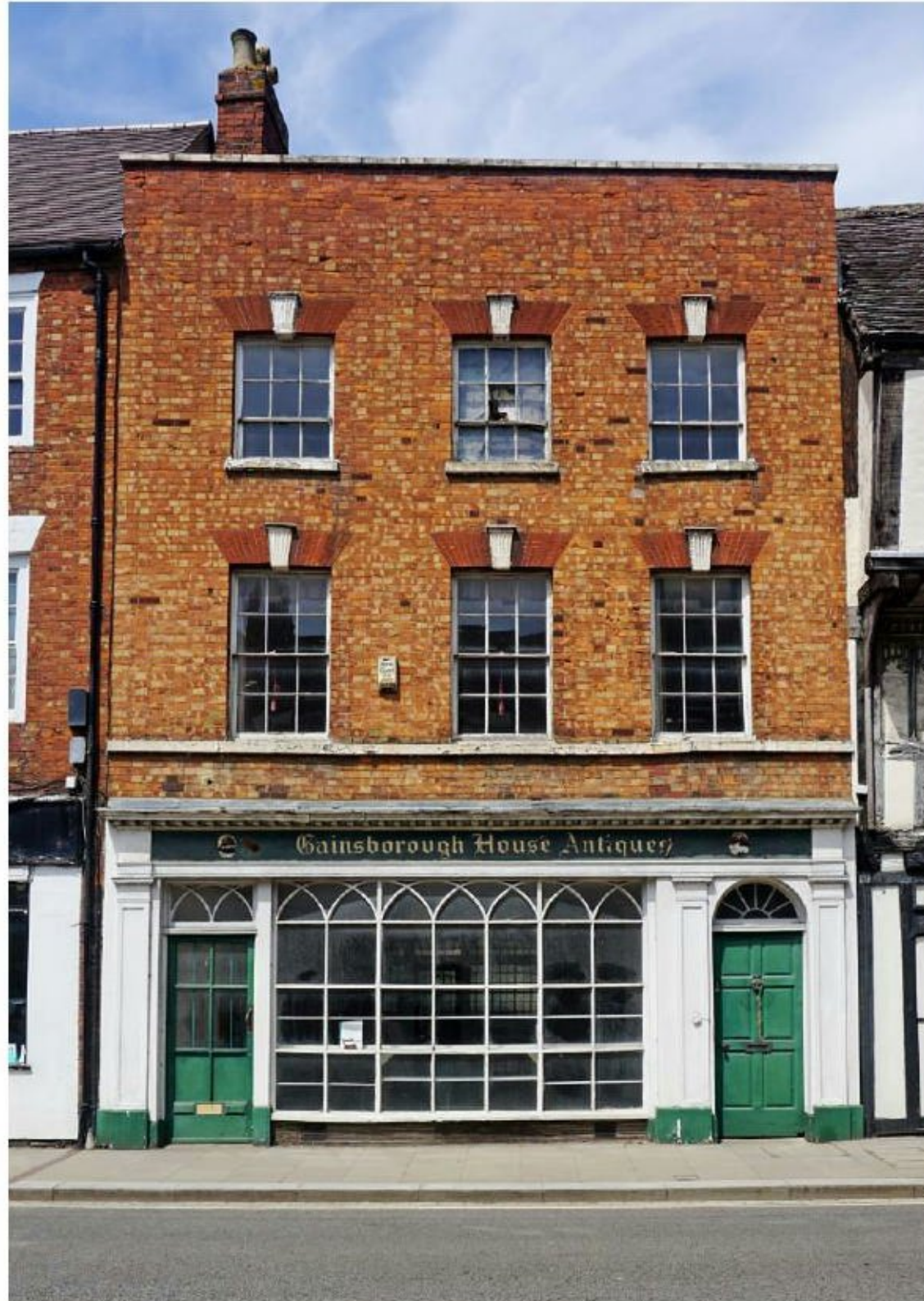
No. 81 Church Street