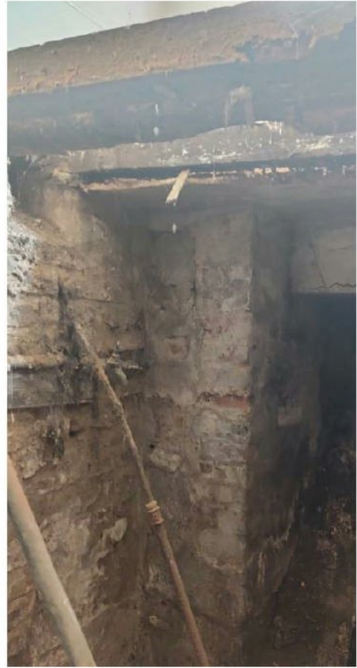
Images of entrance point in cellar