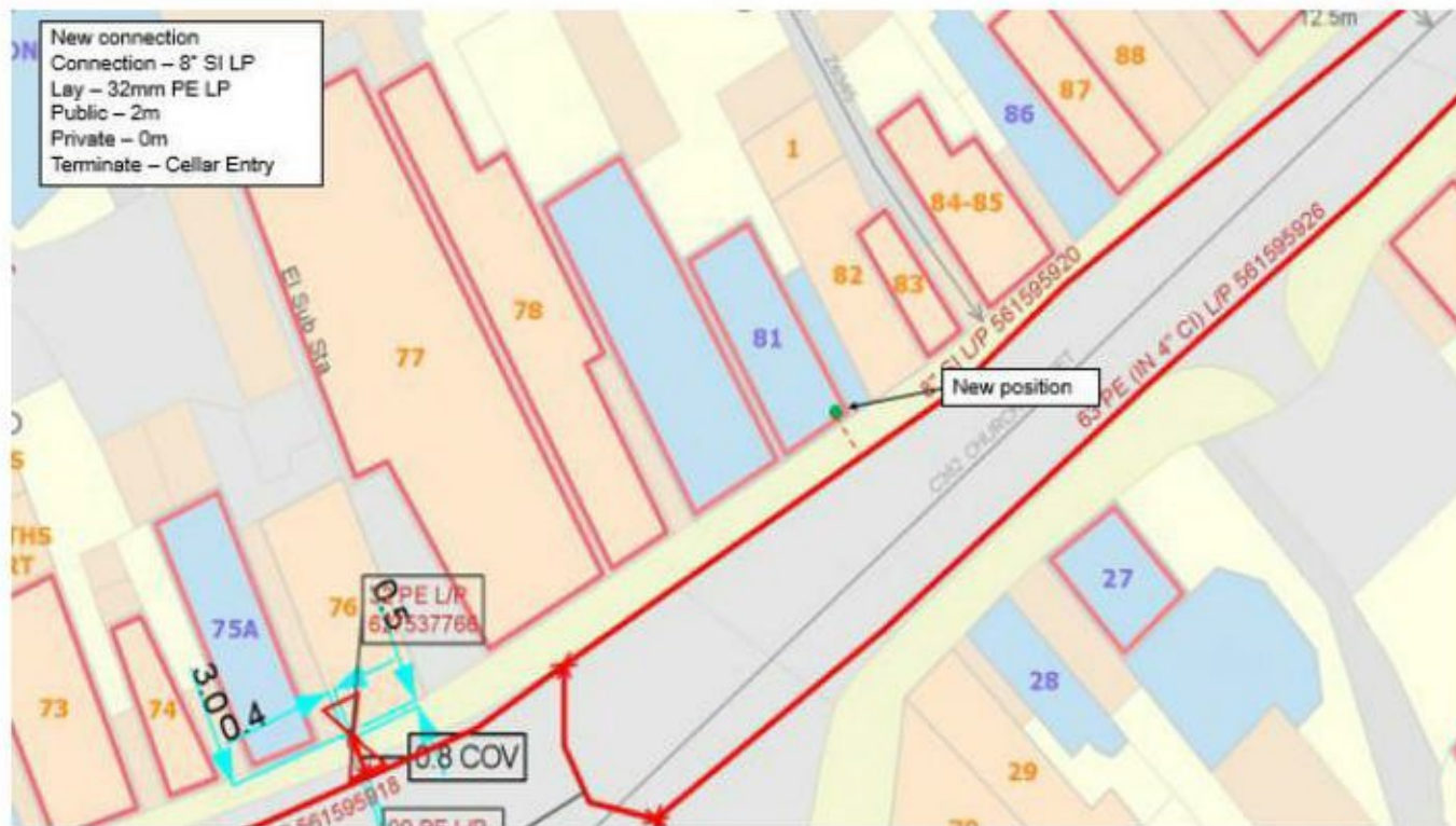
Location plan showing new gas installation position at no. 81 Church Street