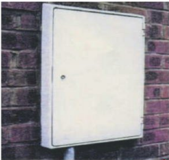
(D) BUILT-IN METER BOX

Proposed gas meter would be located in the cellar near the gas supply connection. This will protect the fabric of the building with minimal disruption to its aesthetics and history.