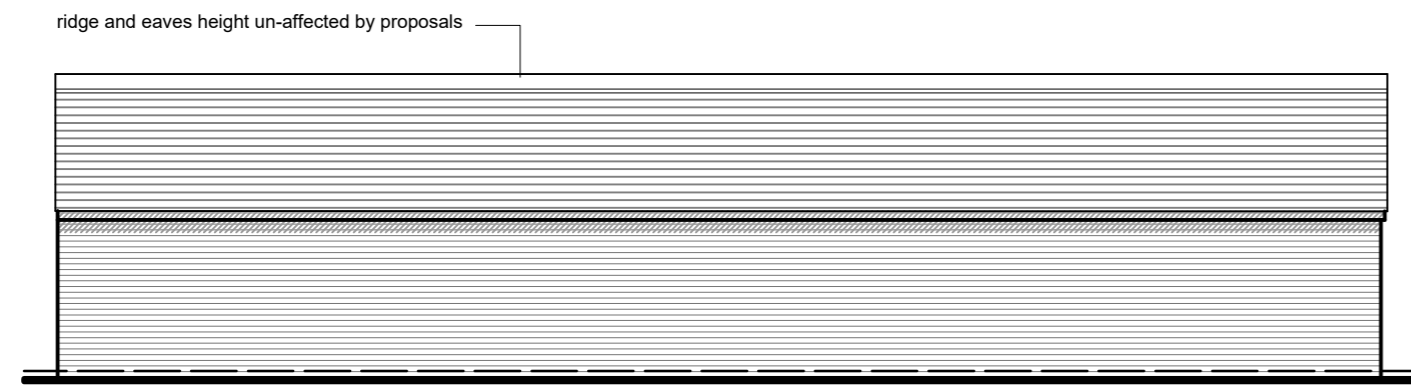
North south east elevation Scale 1:100