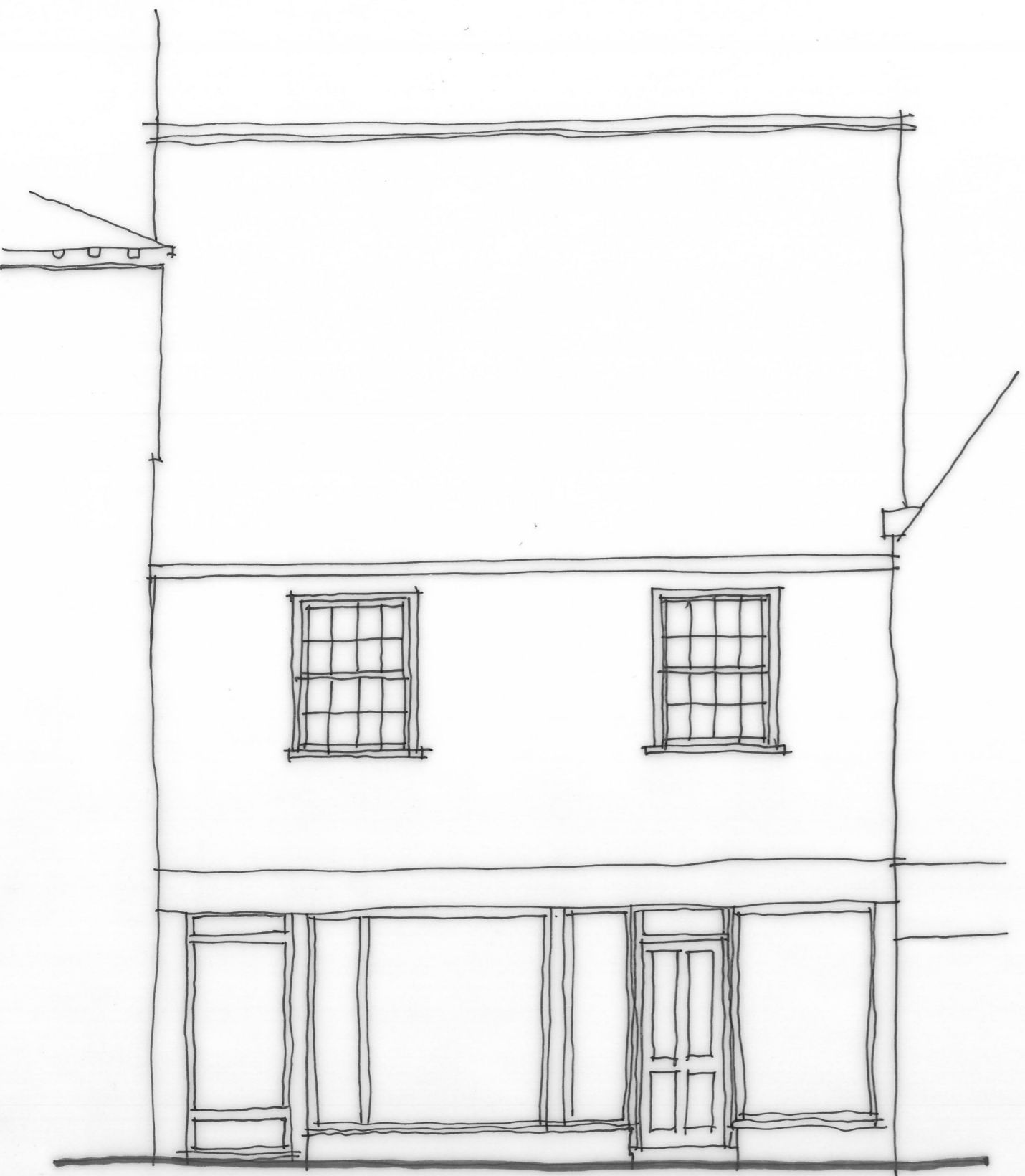
WEST [HATTER STREET] ELEVATION.