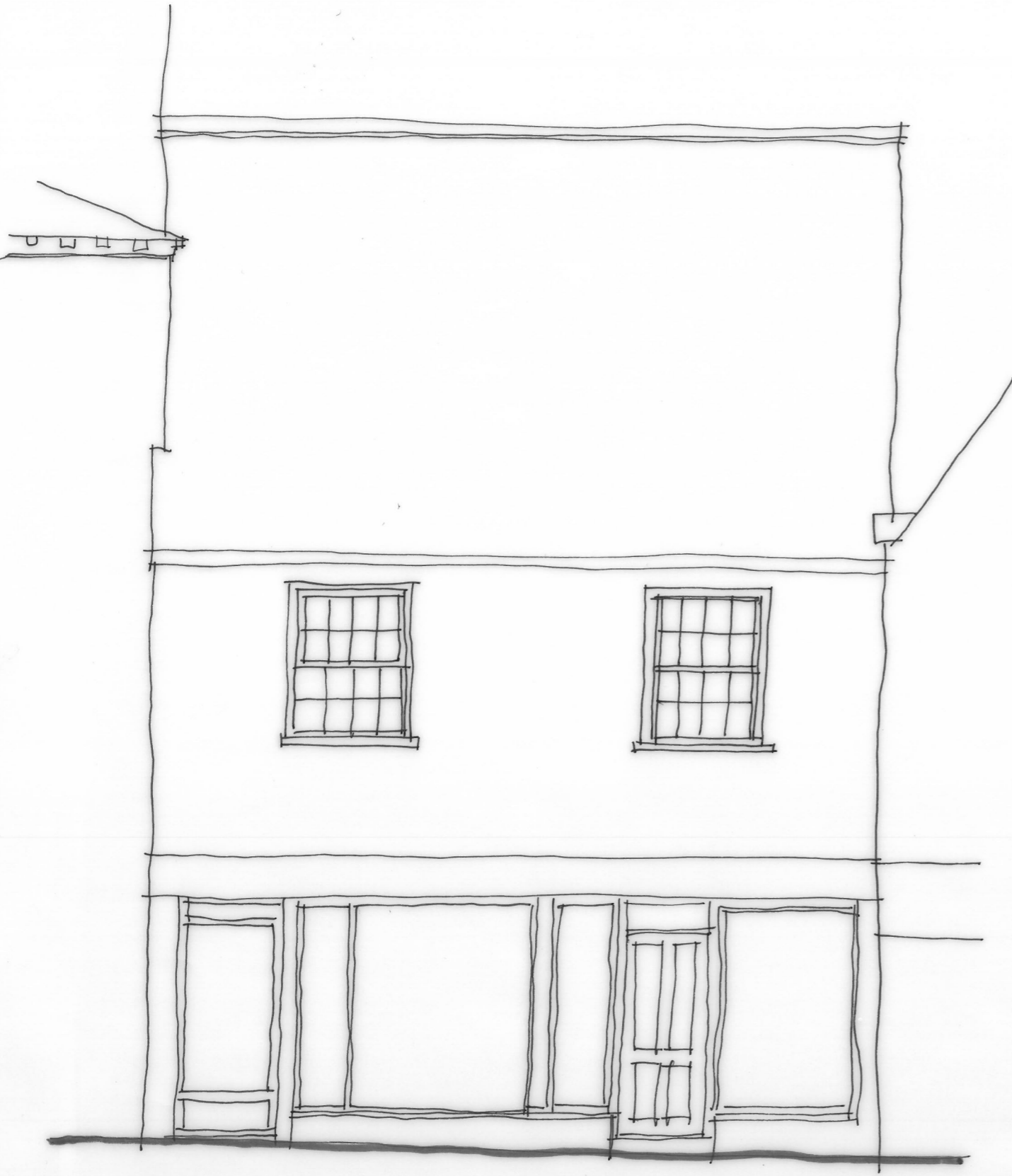
WEST [HATTER STREET] ELEVATION.