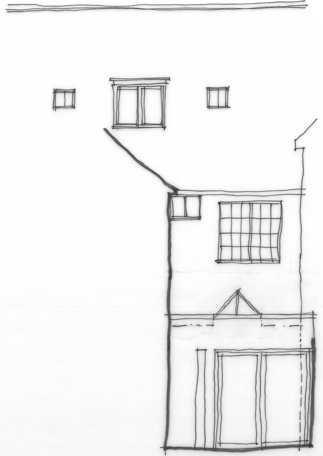
EAST / GARDEN ELEVATION.

DO NOT SCALE THIS DRAWING - USE DIMENSIONS The Contractor is to check and verify all dimensions on site before starting work and report any omissions or errors. This drawing is to be read in conjunction with all relevant consultants and specialists drawings. This Drawing is Copyright This drawing is issued for the sole and exclusive use of the named recipient. Distribution to any third party is on the strict understanding that no liability is accepted by Thurlow Architects for any discrepancies, errors or omissions that may be present, and no guarantee is offered as to the accuracy of information shown.