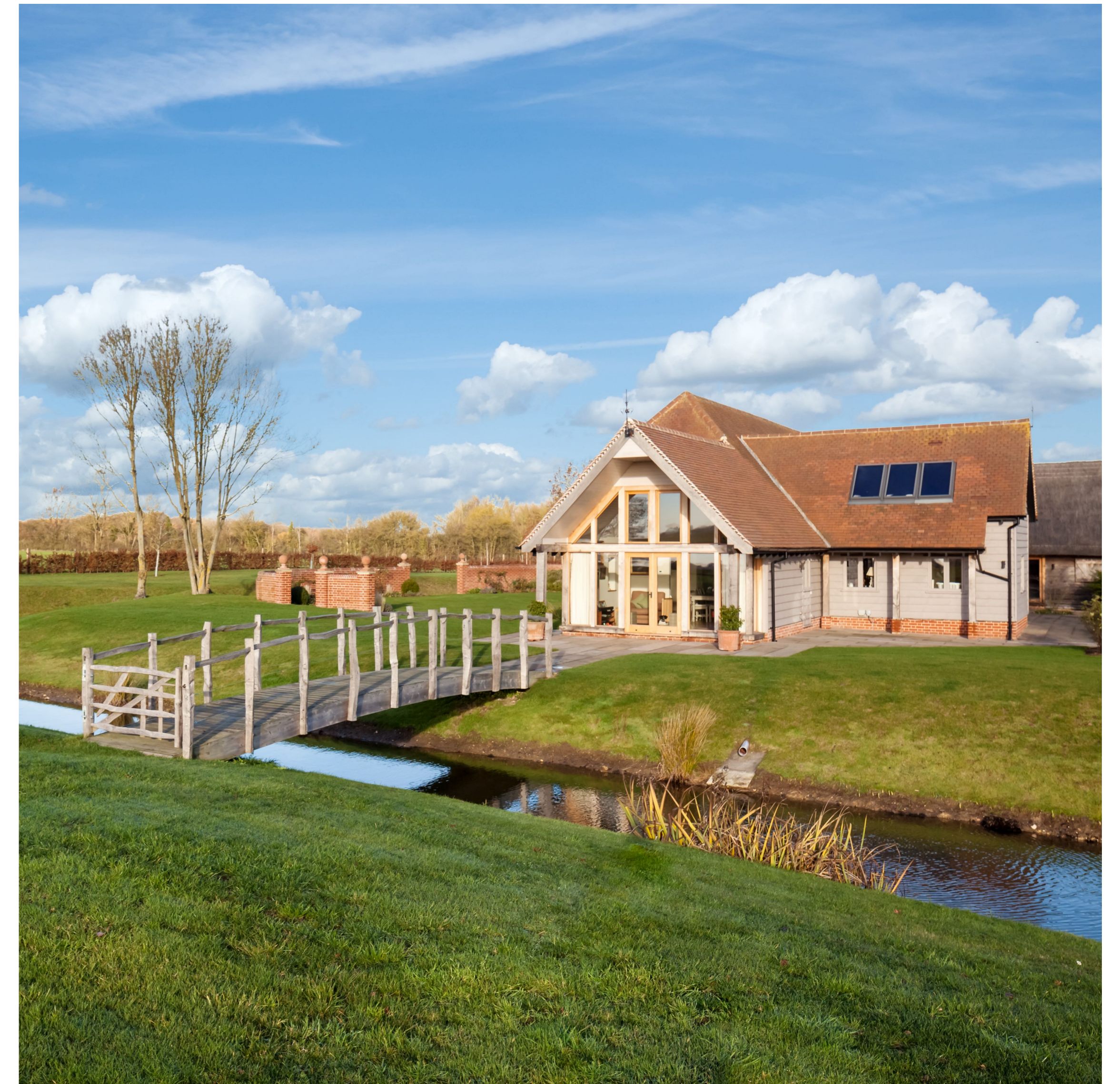
Looking north west across moat to existing dwelling