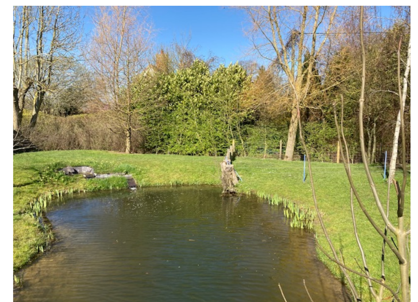
View from bridge towards north end of moat, where proposed home office pod is to be located.

Contractor is responsible for all setting out and must check dimensions on site before work is put in hand. Written dimensions only to be taken, this drawing must not be scaled. JAP Architects to be immediately notified of suspected omissions or discrepancies. ©