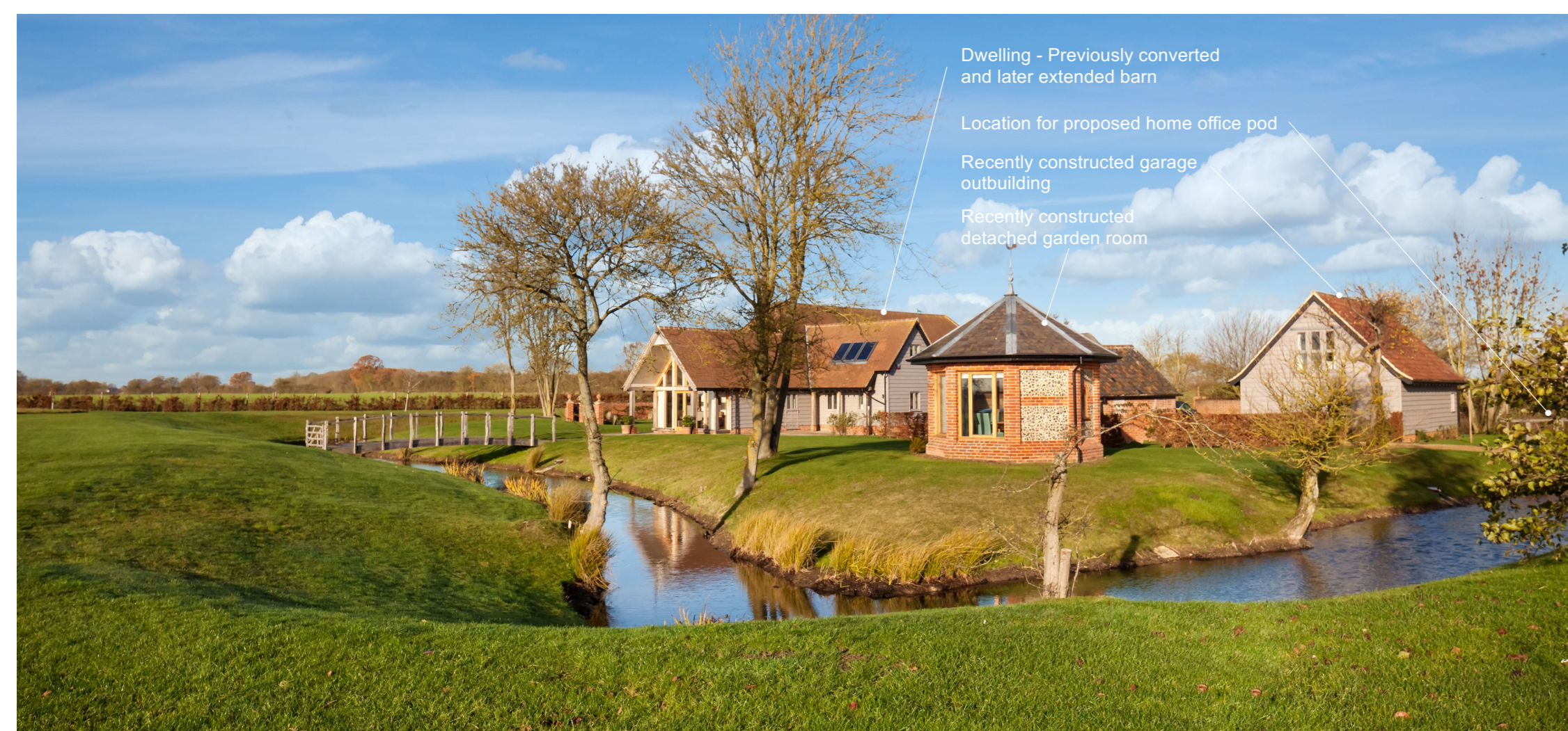
Looking north east across moat to existing garden room. Dwelling and outbuilding beyond