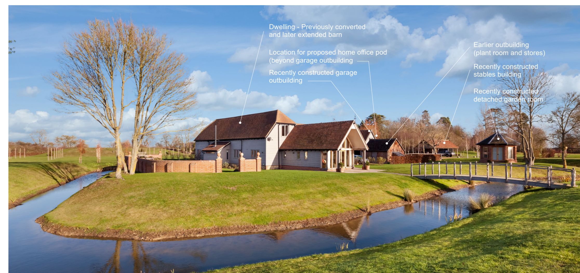
Looking north east across moat to existing dwelling. Various outbuildings beyond