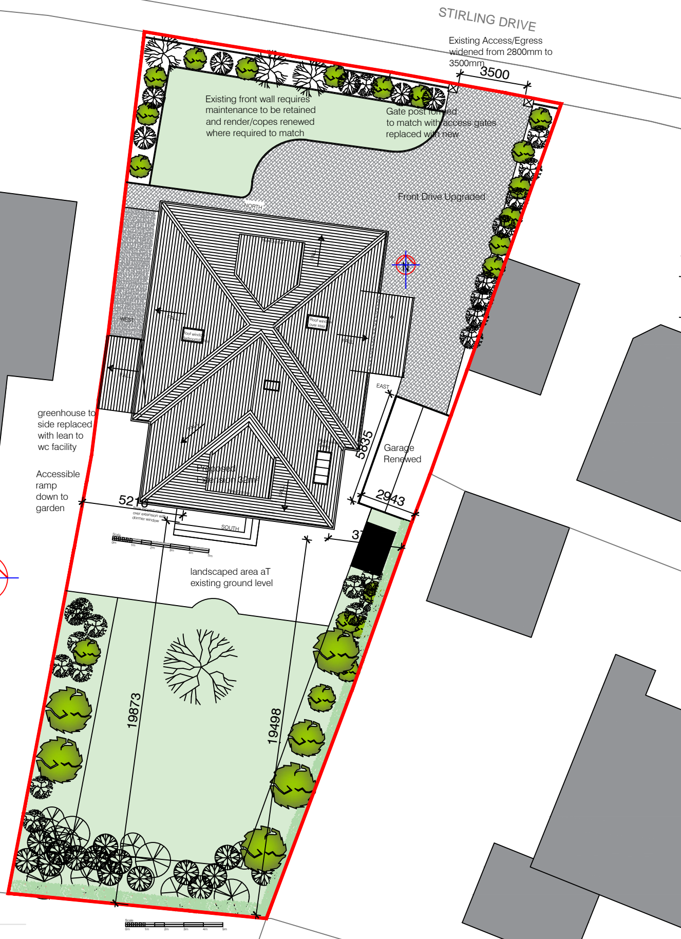
PL 90 003 Proposed Site Block Plan Scale 1:200