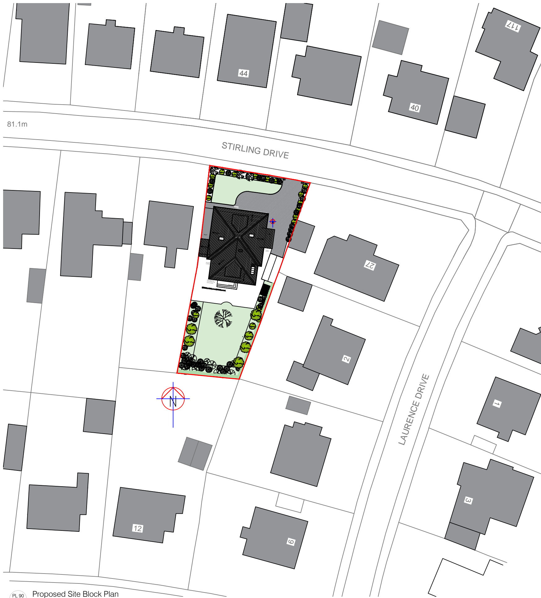
PL 90 002 Proposed Site Block Plan Scale 1:500