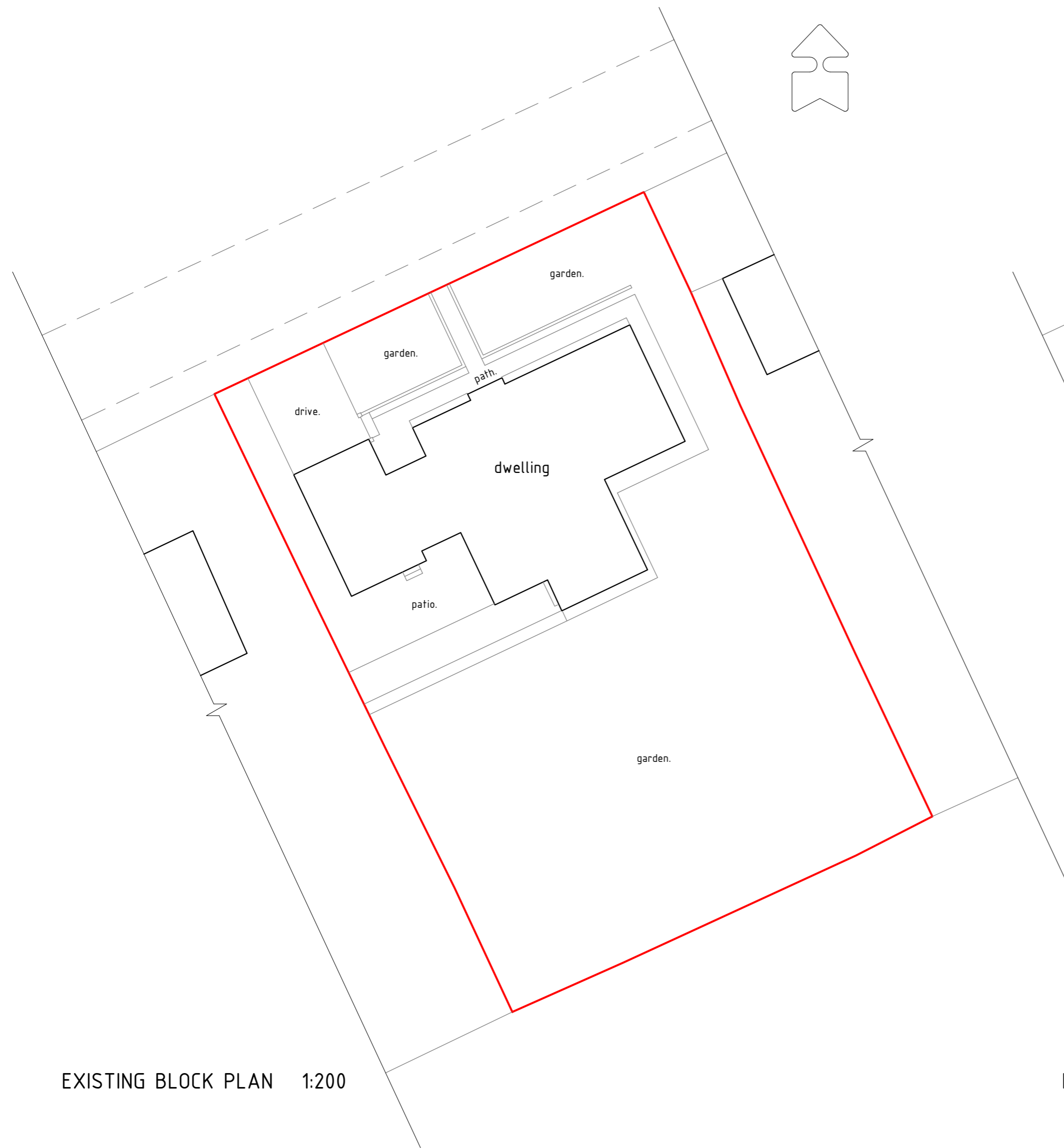
EXISTING BLOCK PLAN 1:200