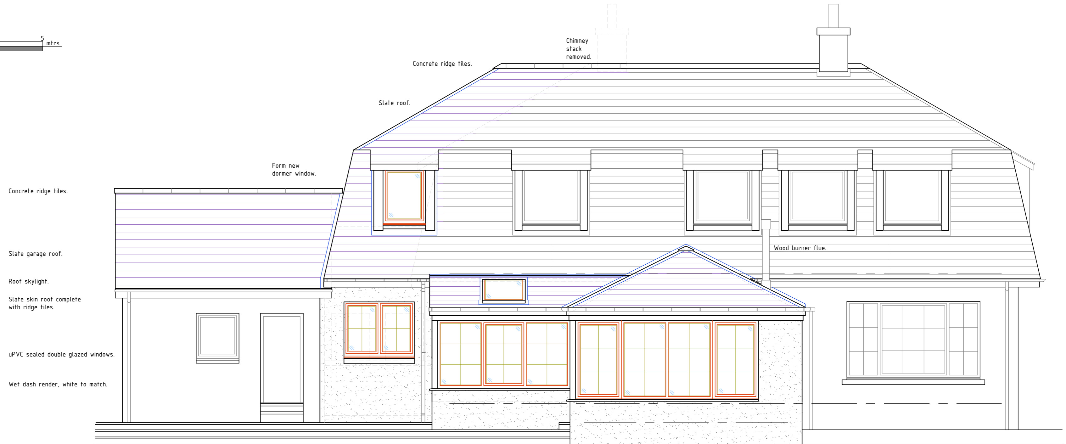
PROPOSED SOUTH ELEVATION 1:50