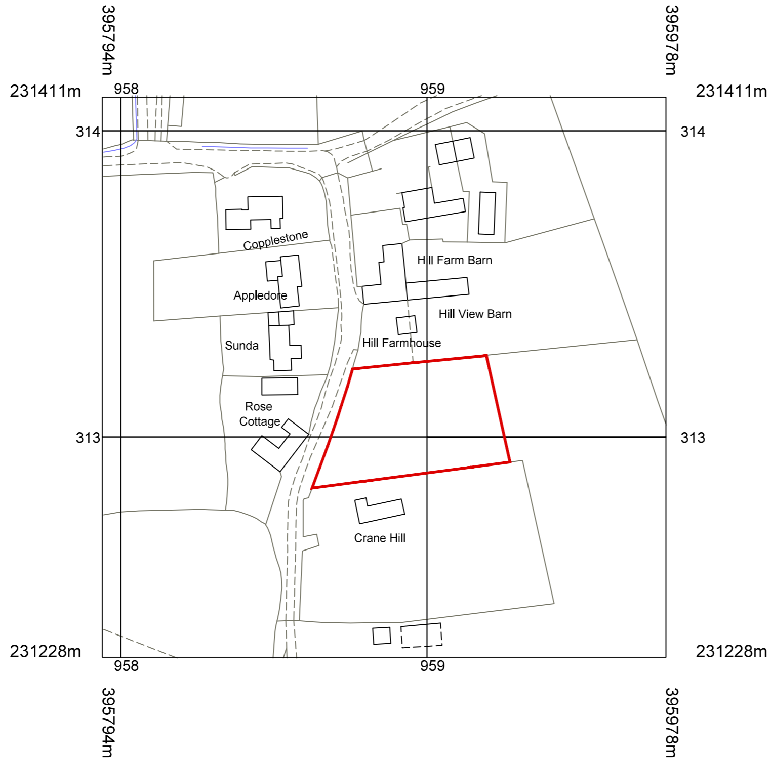
SITE LOCATION 1:1250