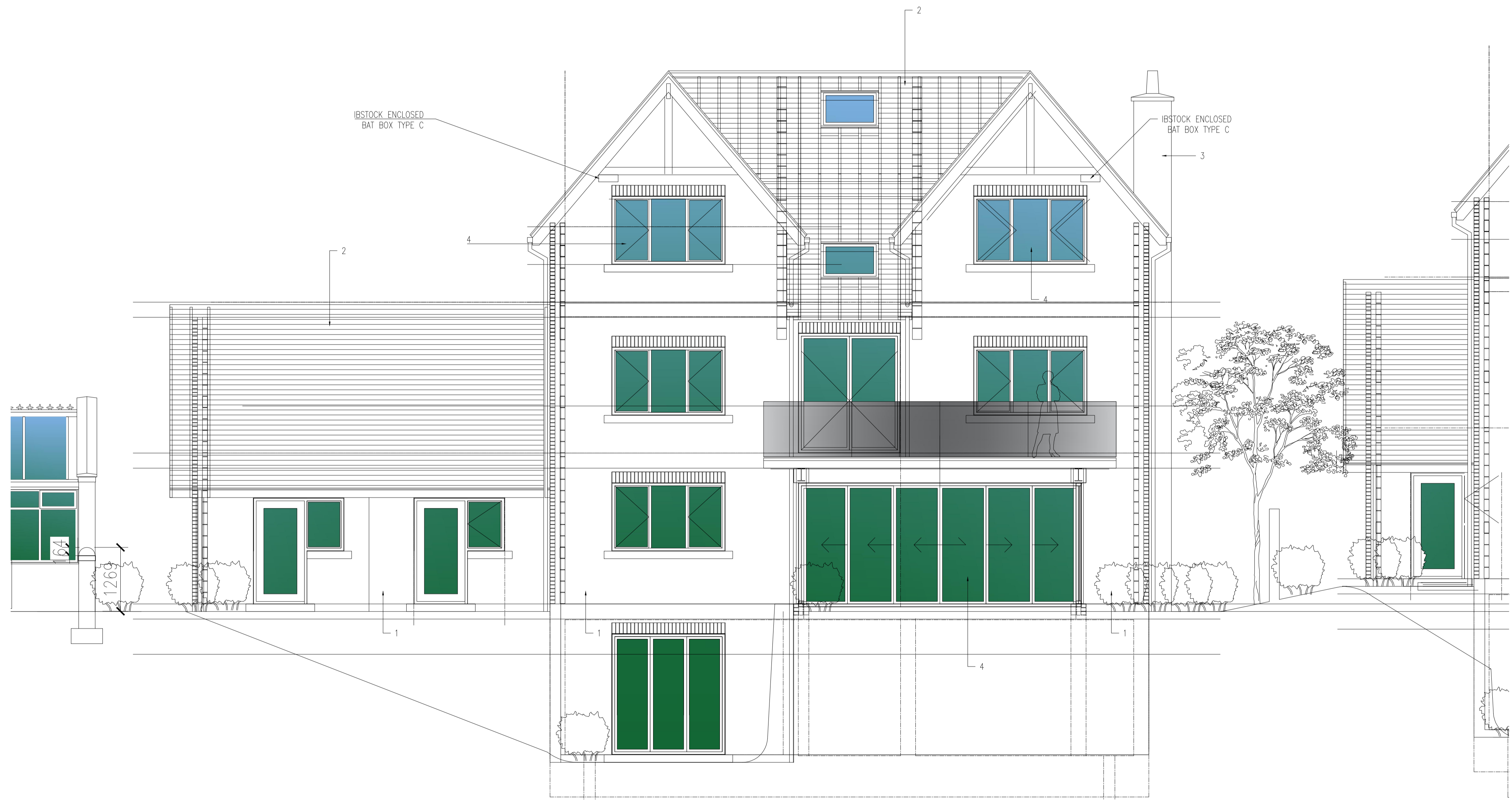
UNIT 3 REAR ELEVATION

Notes Copyright. All rights reserved. This drawing must not be reproduced without permission. This drawing must not be scaled. Dimensions are in millimetres unless specified.