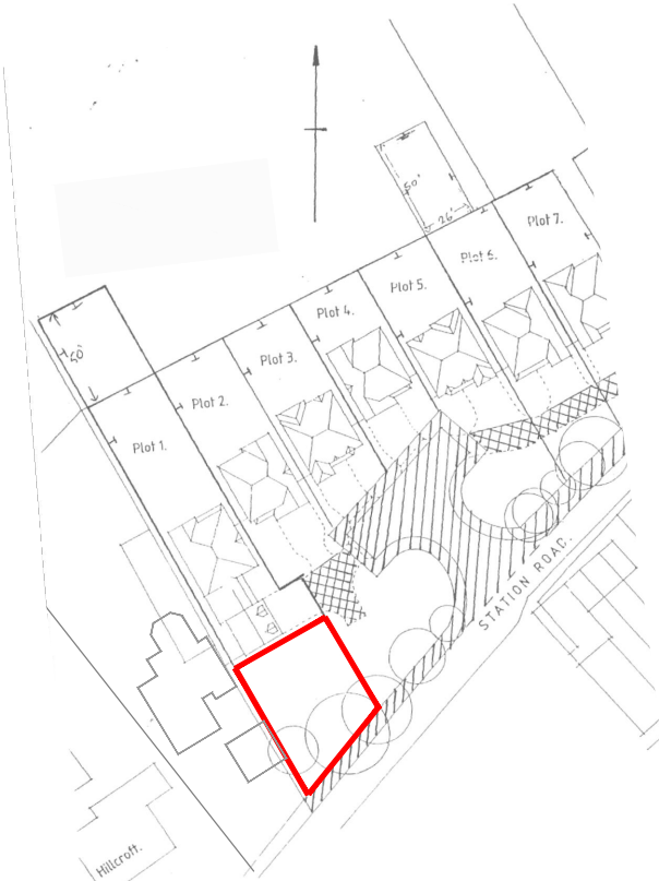
LOCATION PLAN scale 1:1250 / A3