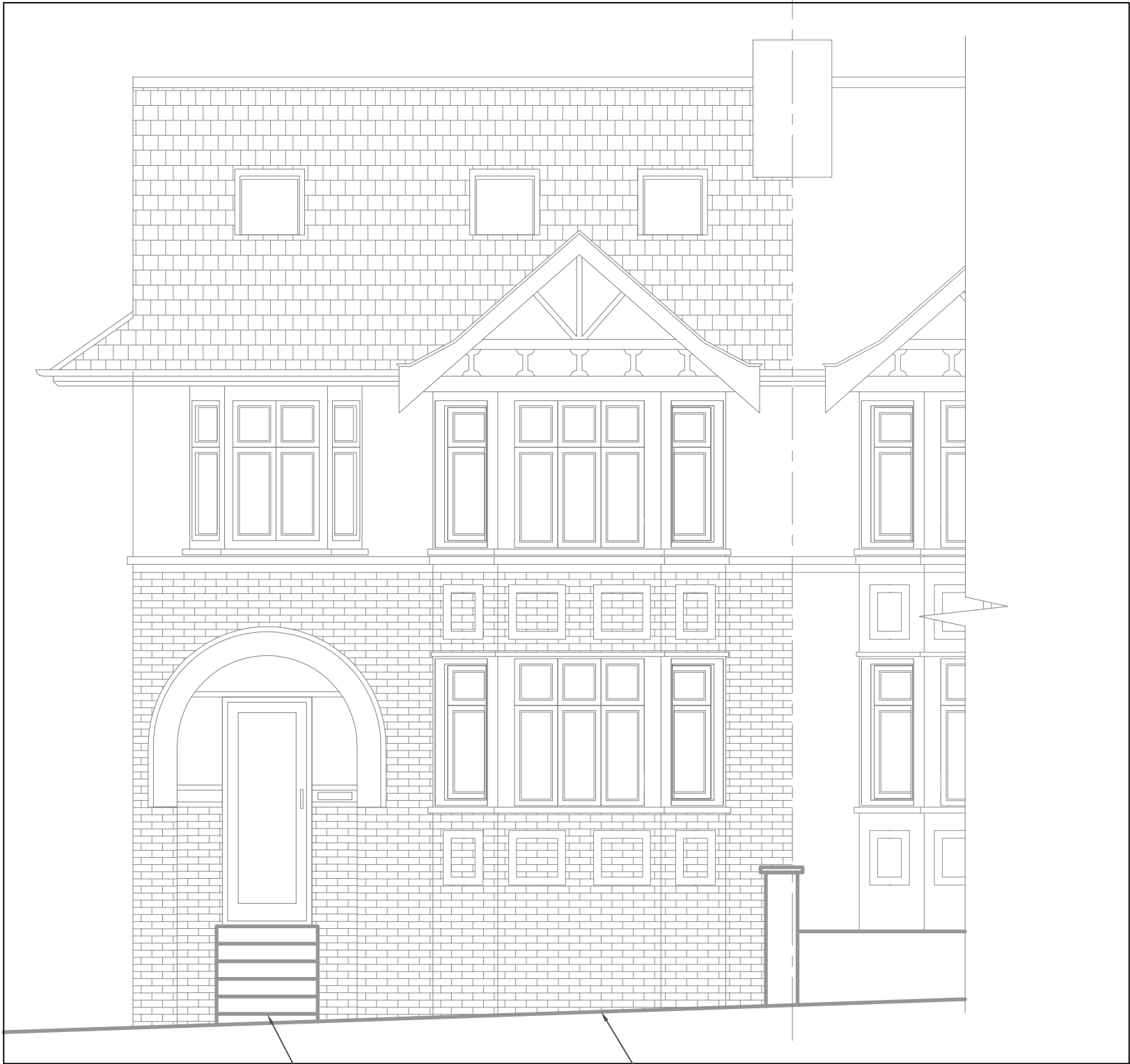
1) Elevation 2