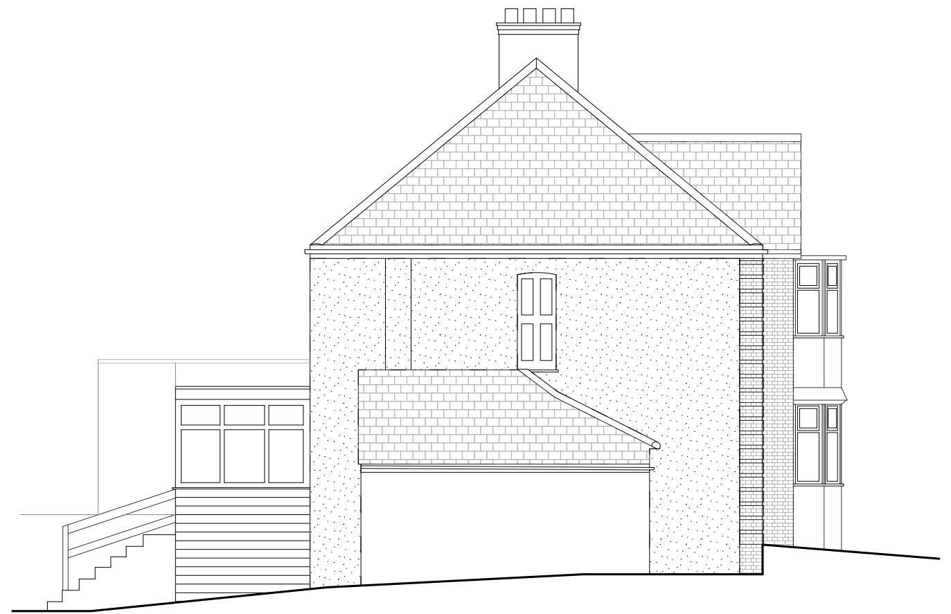
2 Existing Side Elevation Scale: 1:100