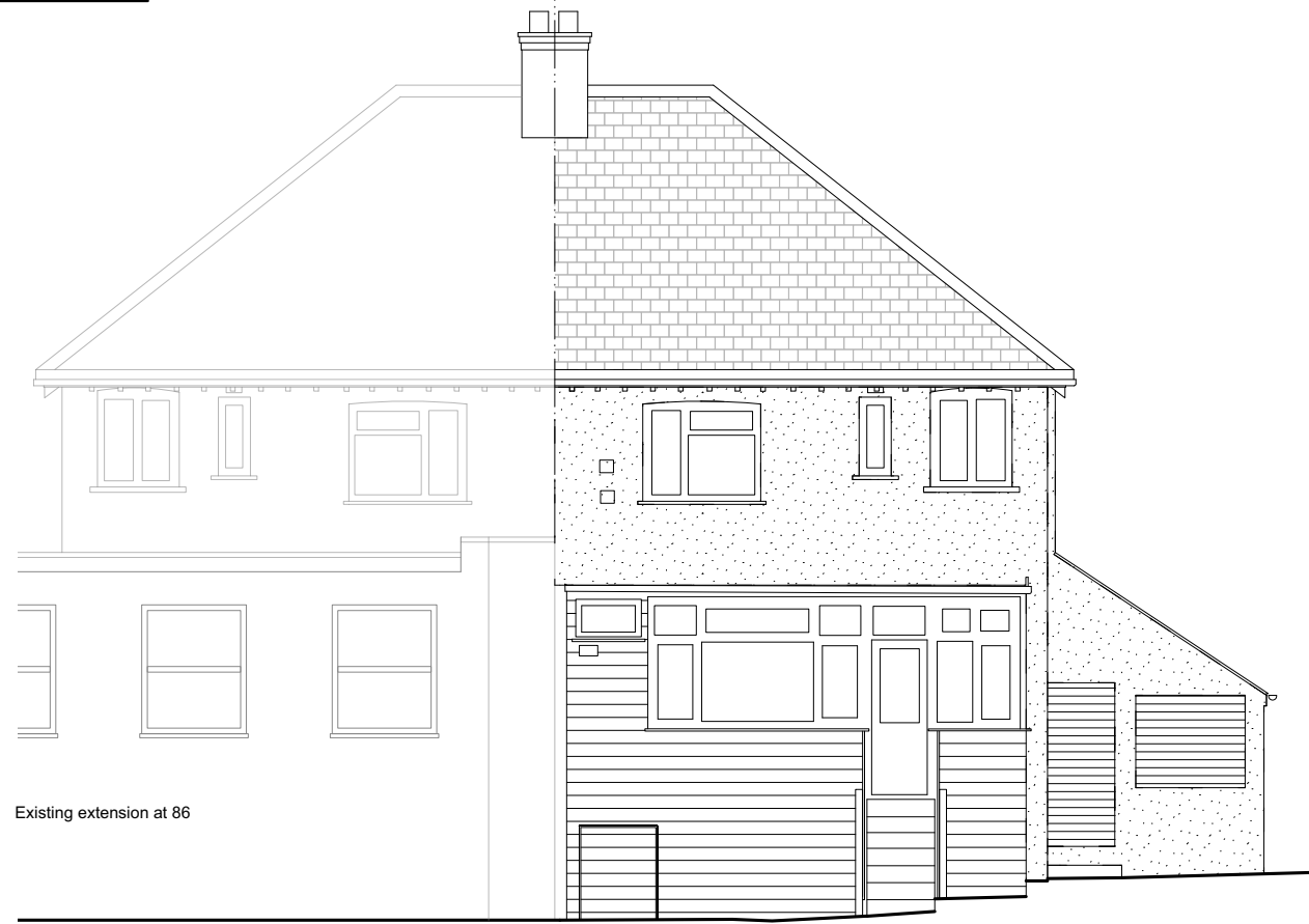
3 Existing Rear Elevation Scale: 1:100