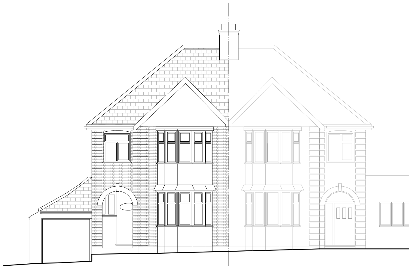
1 Existing Front Elevation Scale: 1:100