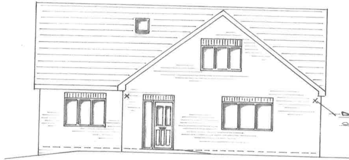
FRONT ELEVATION (NW) 1:100