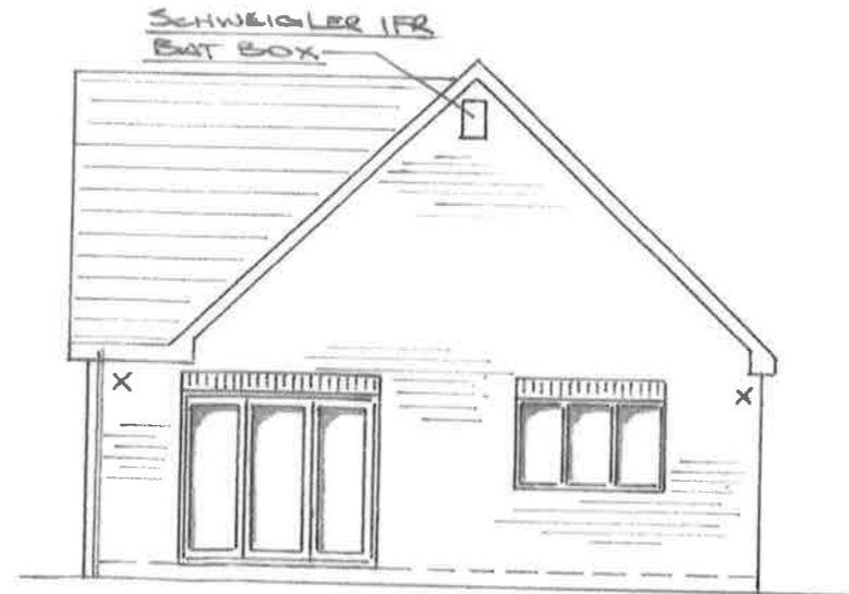
SIDE ELEVATION (SW) 1:100