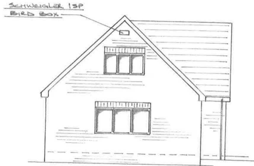
SIDE ELEVATION (NE) 1:100

DENOTES THE POSITION OF EXTERIOR DOWNLIGHTS