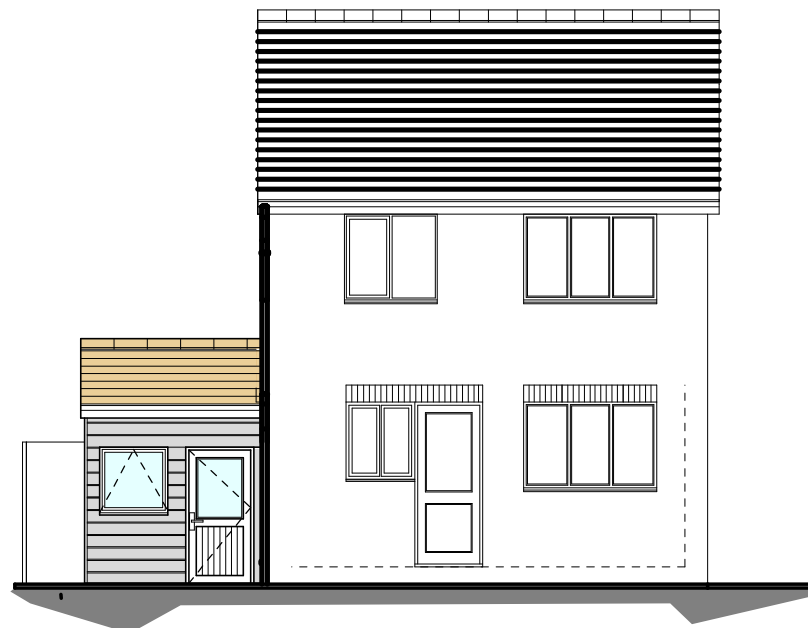
South elevation as proposed