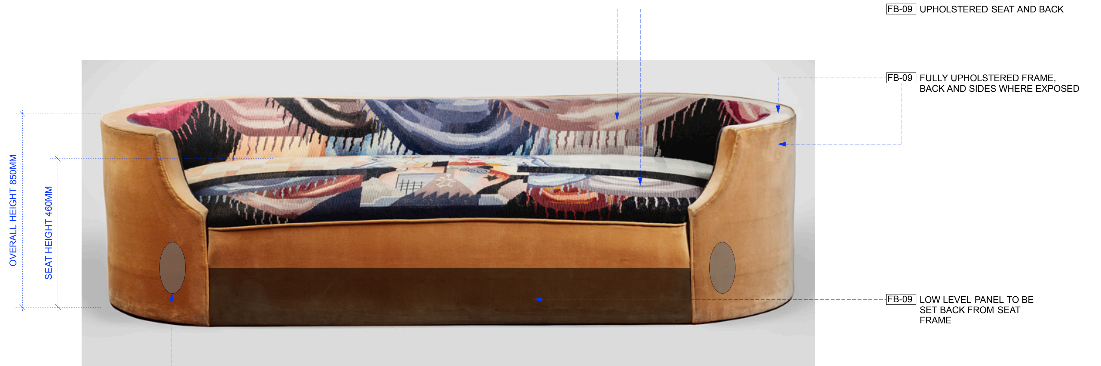
01 BANQUETTE - REFERENCE IMAGE NTS DE-L1.02

[LT-WL02] LOW LEVEL LIGHT TO BANQUETTE ENDS. REFER TO LIGHTING DESIGNERS INFORMATION. CONTRACTOR TO ALLOW FOR SUITABLE CABLE ROUTE