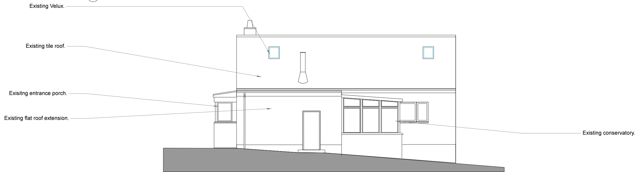
⊙ NORTH ELEVATION 1:100