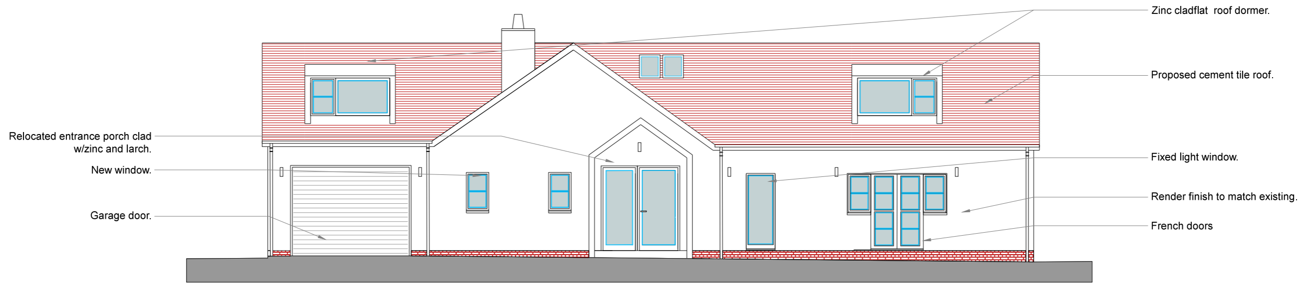
⊙ EAST ELEVATION 1:100