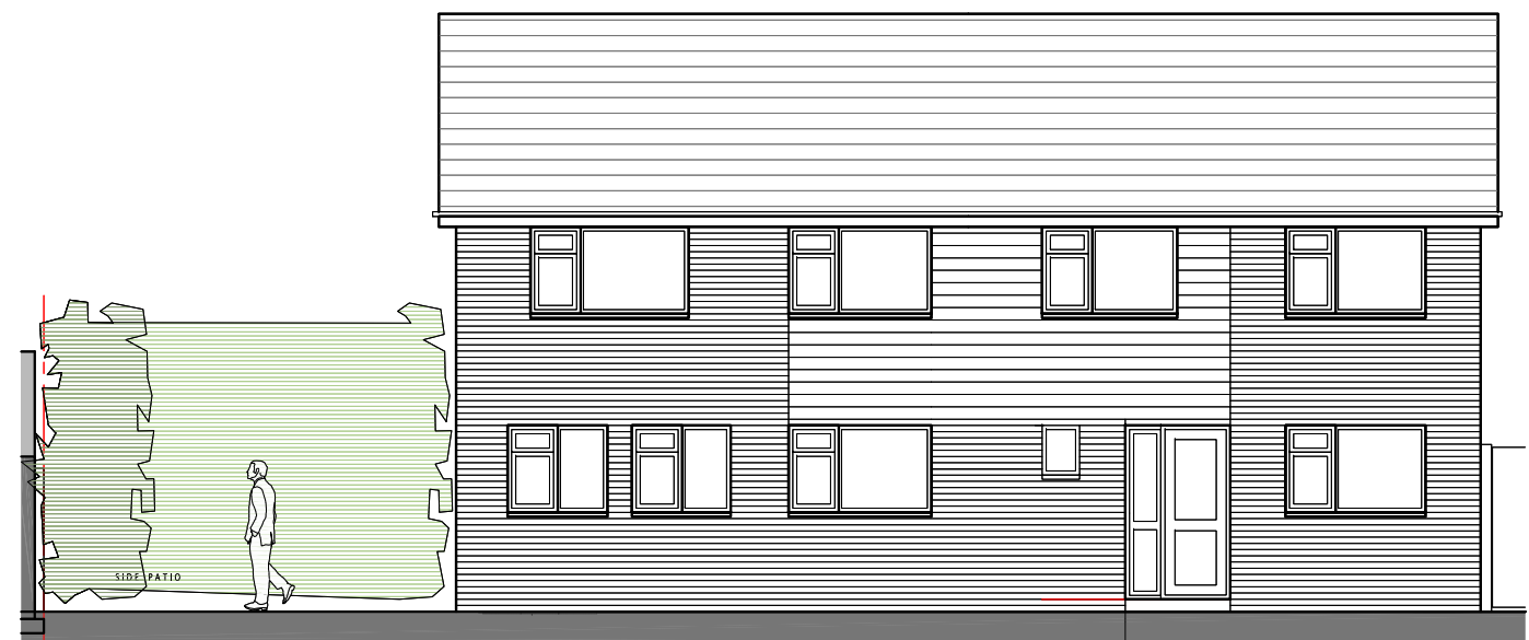
FRONT ELEVATION EXISTING 1:100