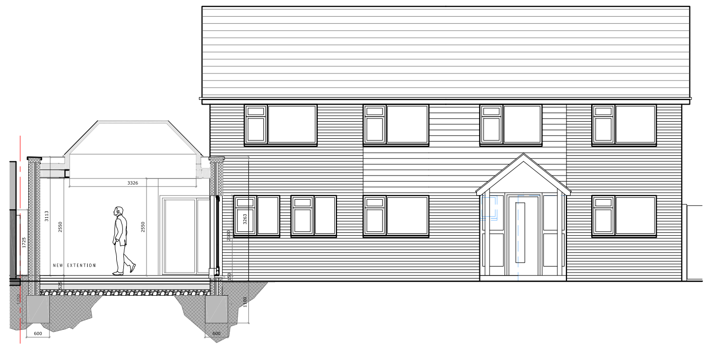
FRONT ELEVATION PROPOSED 1:100