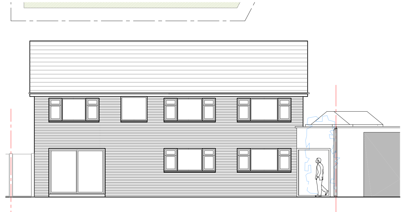
REAR ELEVATION PROPOSED 1:100