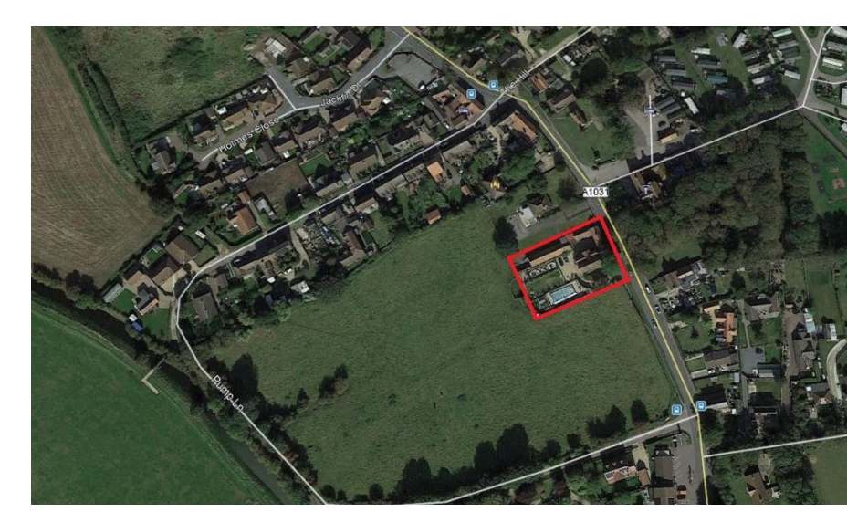
Figure Two - Site Plan

The site has not flooded within living memory and the site was not flooded in either the January 1953 or the June 2007 flood.