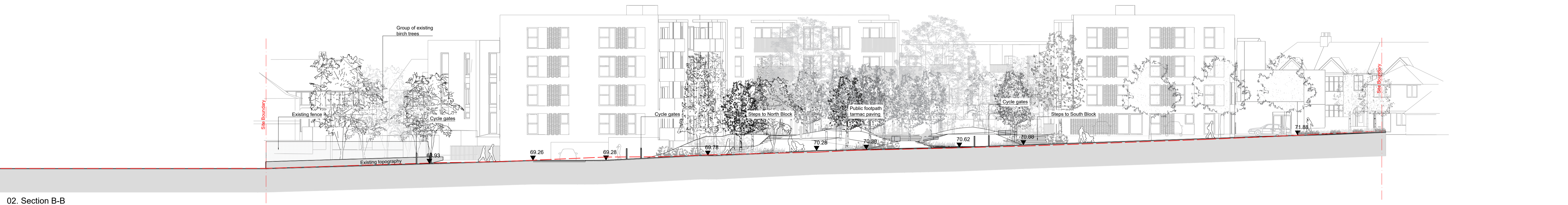
02. Section B-B Scale 1:200