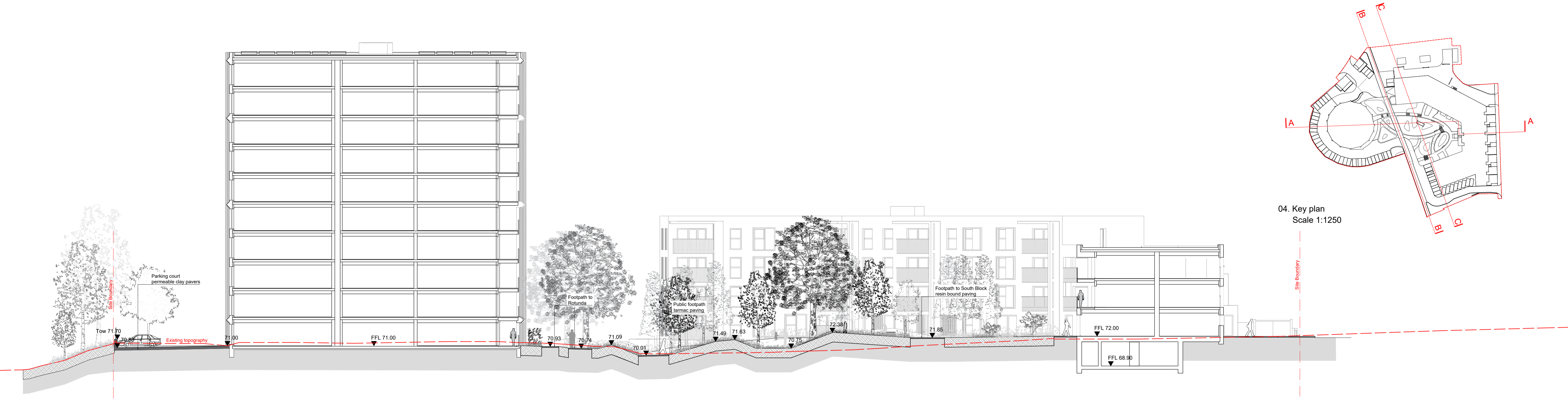
01. Section A-A Scale 1:200