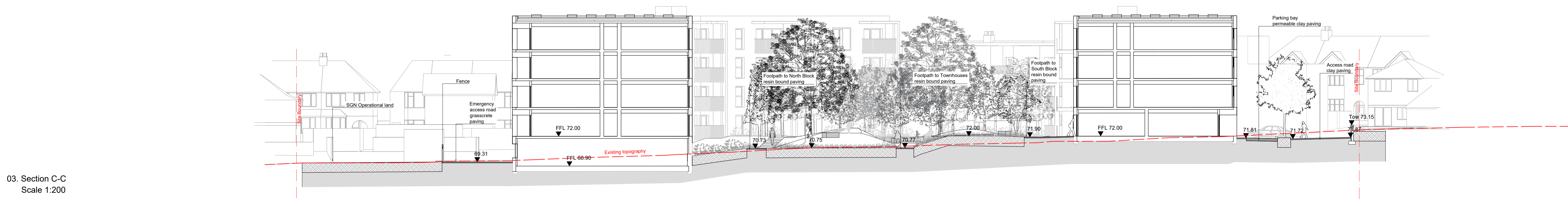
03. Section C-C Scale 1:200

Do not scale drawings. All dimensions to be checked on site. Errors to be reported immediately to landscape architect. To be read in conjunction with all relevant architects, Services and engineers drawings.