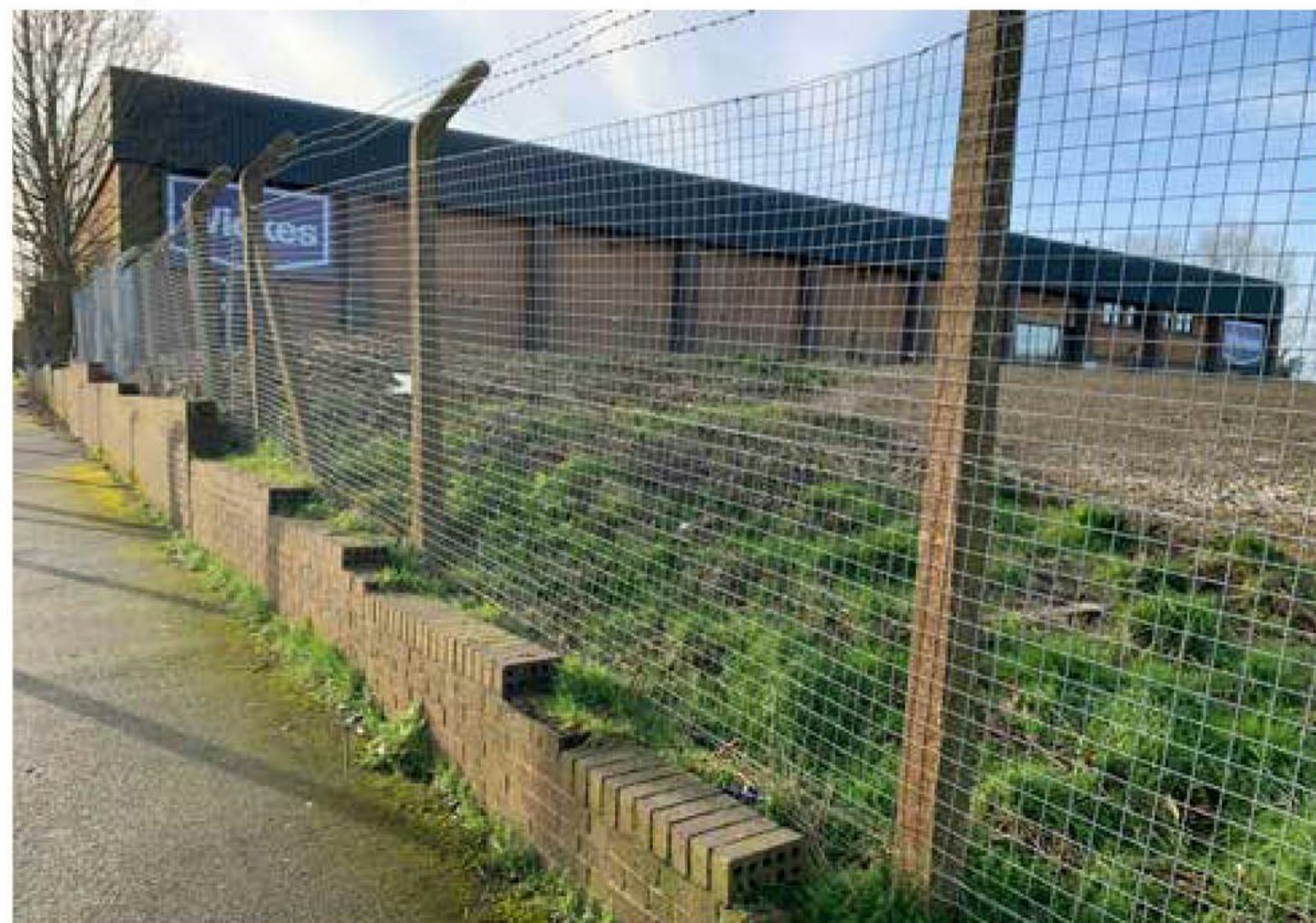
Looking southwest from footpath