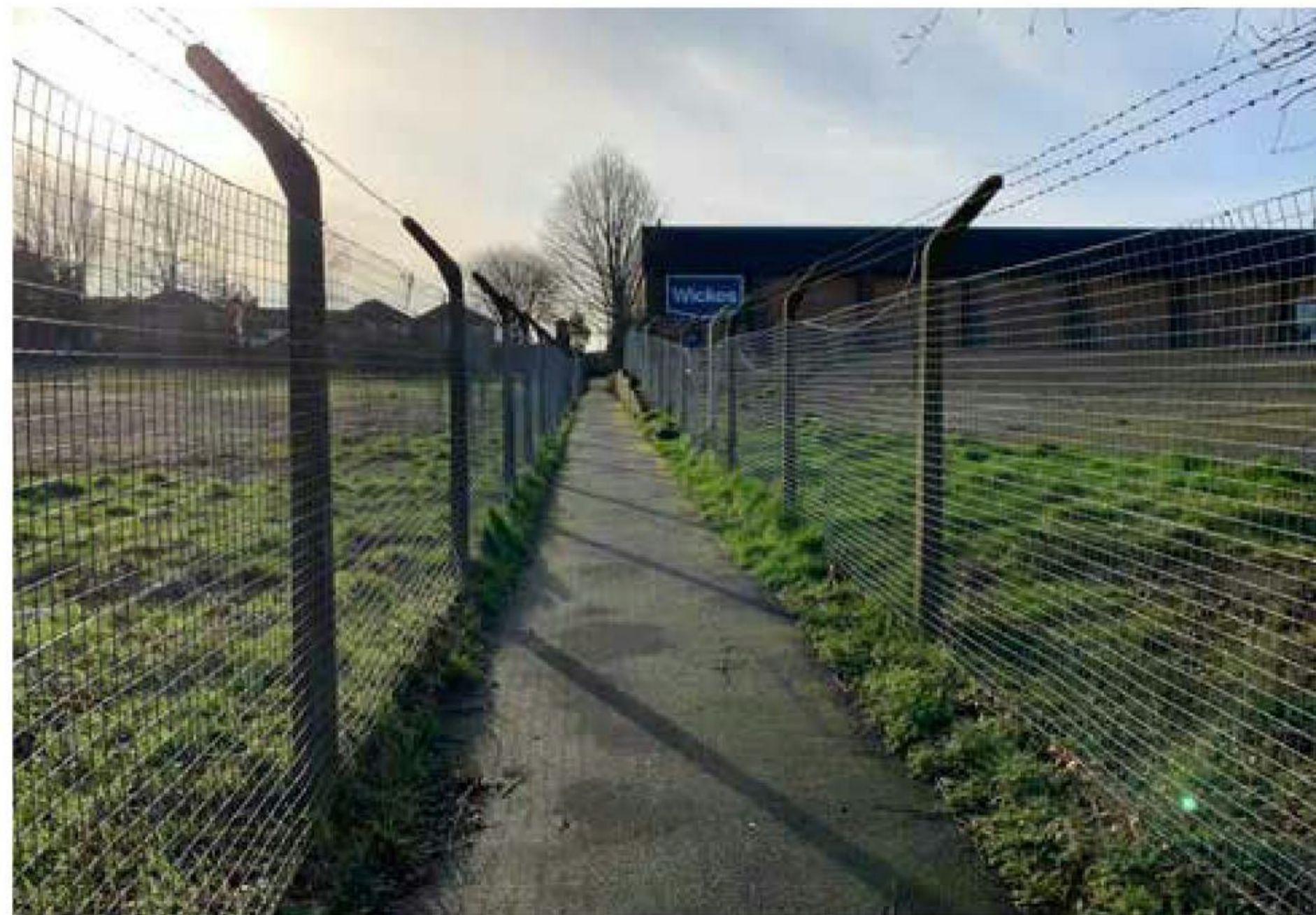
Looking south along footpath

The site topography primarily slopes upwards away from and along the public footpath. The site slopes upwards from north to south with an overall level change of approximately 3.6m. The portion of the site to the west of the public footpath slopes upwards from the point of intersection shown to the site boundary with a level change of approximately 0.5m to the north and 3m to the south. The portion of the site east of the public footpath slopes upwards from west to east and the level changes range between 1.2m and 2.0m.