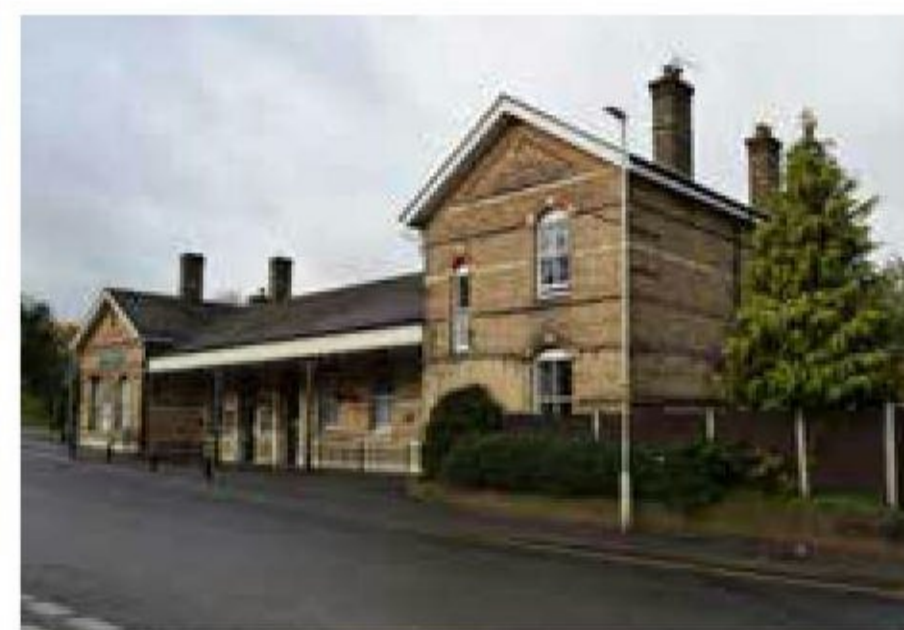
Bat and Ball Station