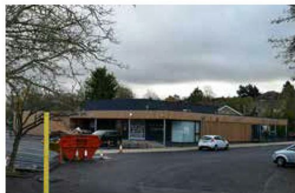
Sevenoaks Community Centre

The areas to the west of the site primarily comprise green space, including agricultural fields and the Sevenoaks Wildlife Reserve, which consists of a series of lakes and forested areas.