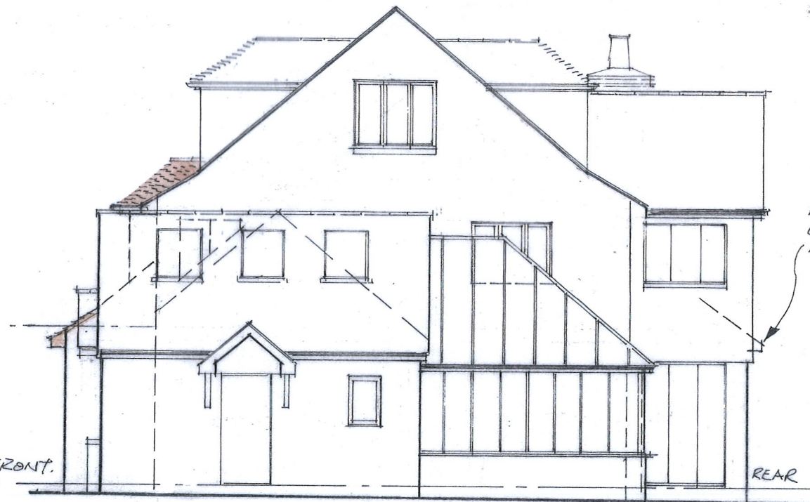
PROPOSED SIDE ELEVATION - WEST

FRONT & REAR WALL OF ORANGERY REDUCED IN HEIGHT