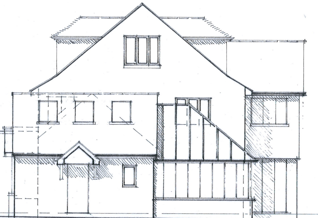
EXISTING SIDE ELEVATION - WEST

FRONT & REAR WALL OF ORANGERY REDUCED IN HEIGHT