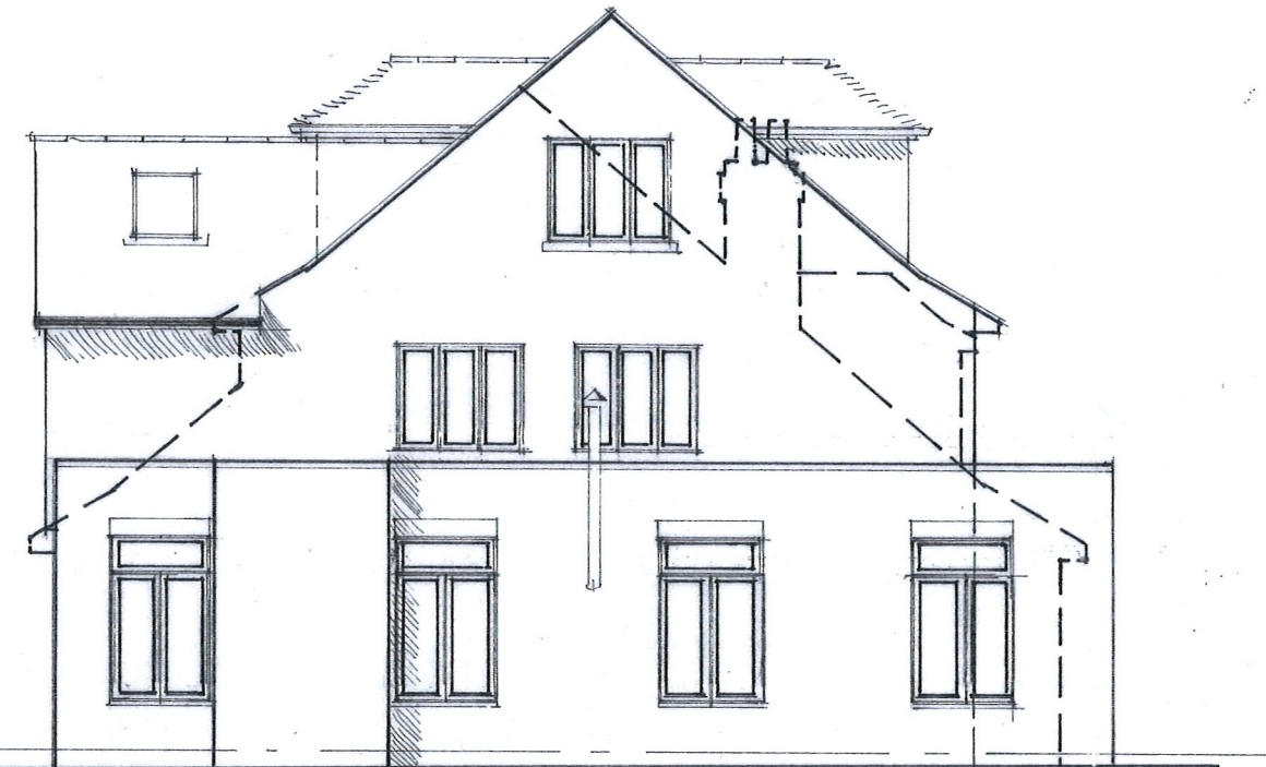
EXISTING SIDE ELEVATION - EAST