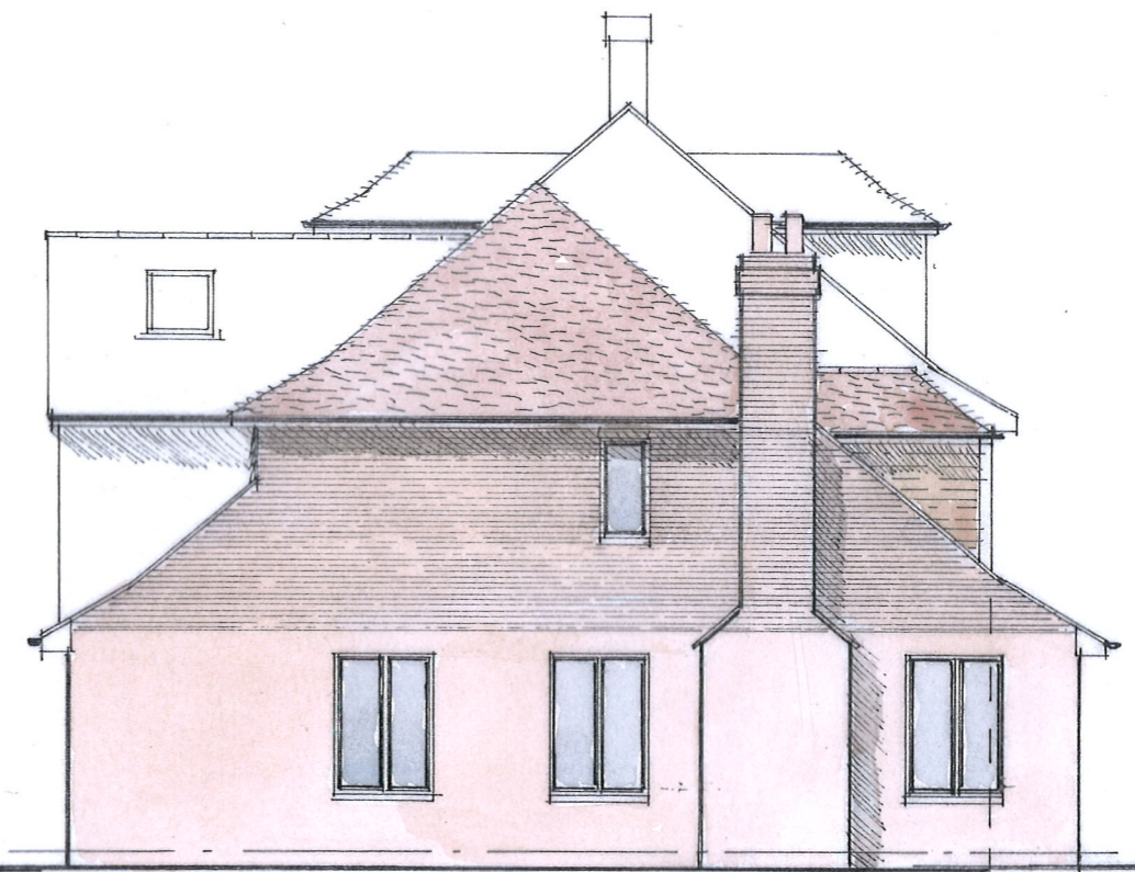
SIDE ELEVATION - EAST