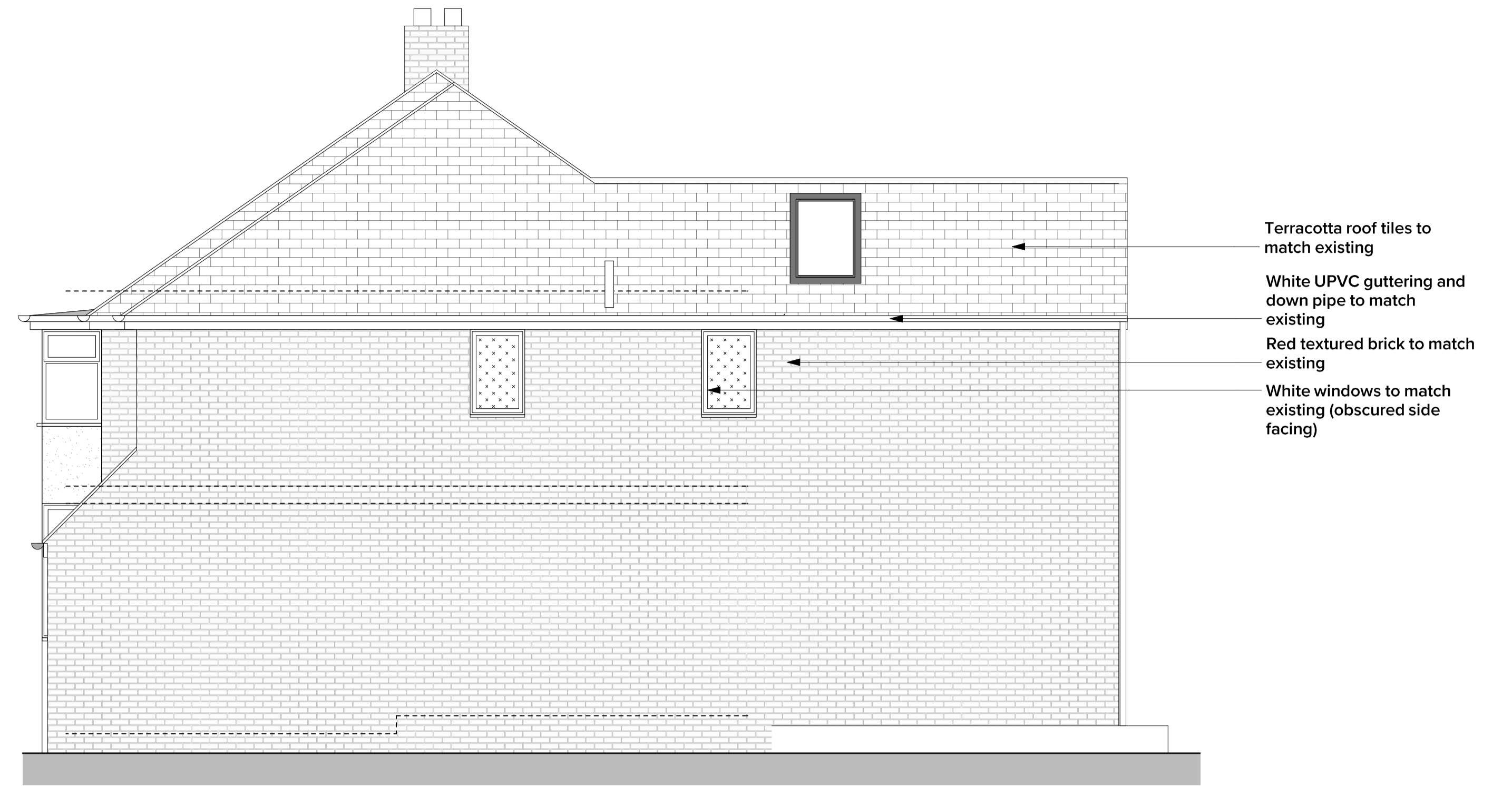
2 Side Elevation - South Facing PL-5 SCALE: 1:50