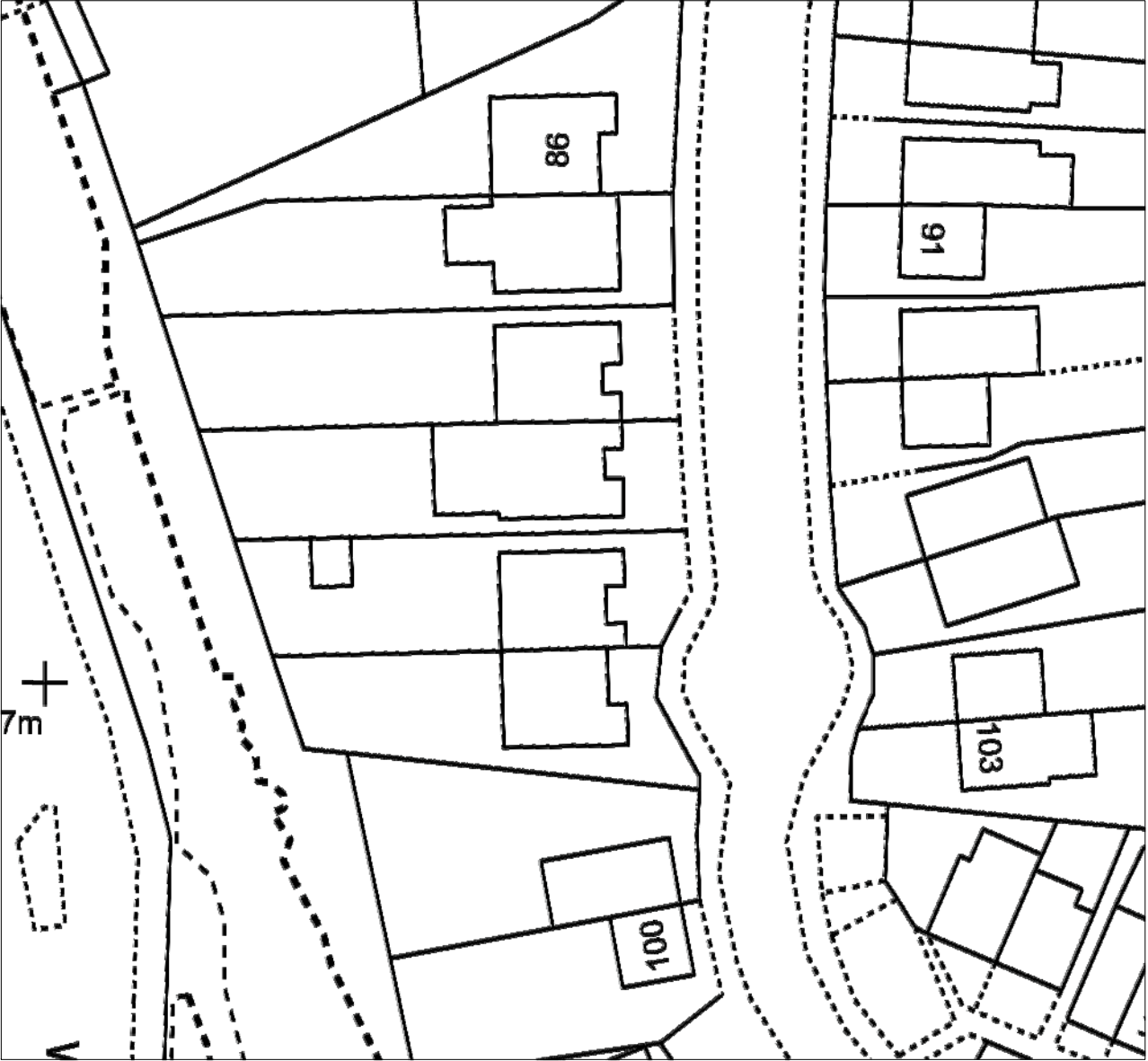
Block Plan @ 1:500