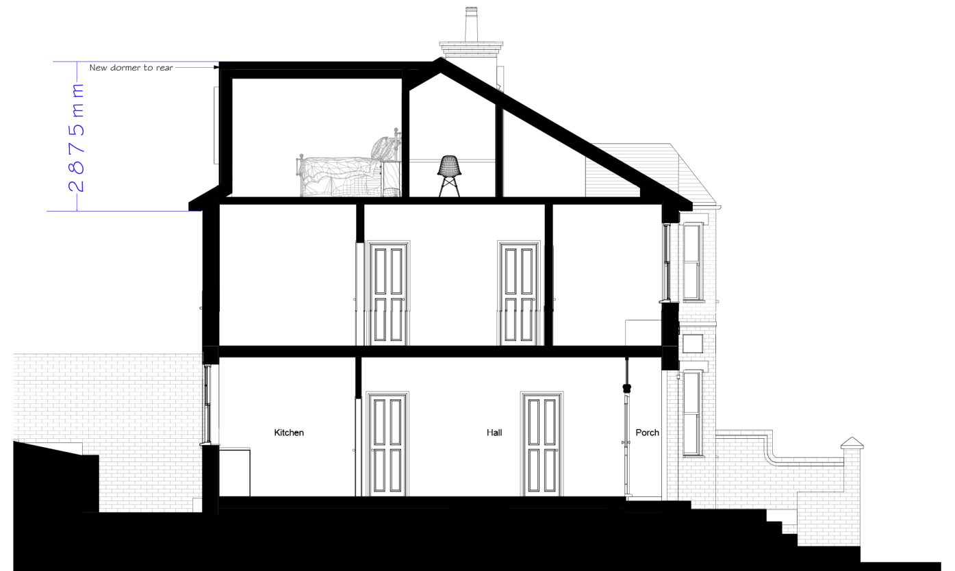
1 Proposed Section 1:100