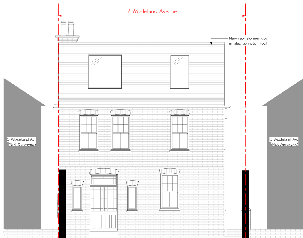
3 Proposed Rear Elevation 1:100