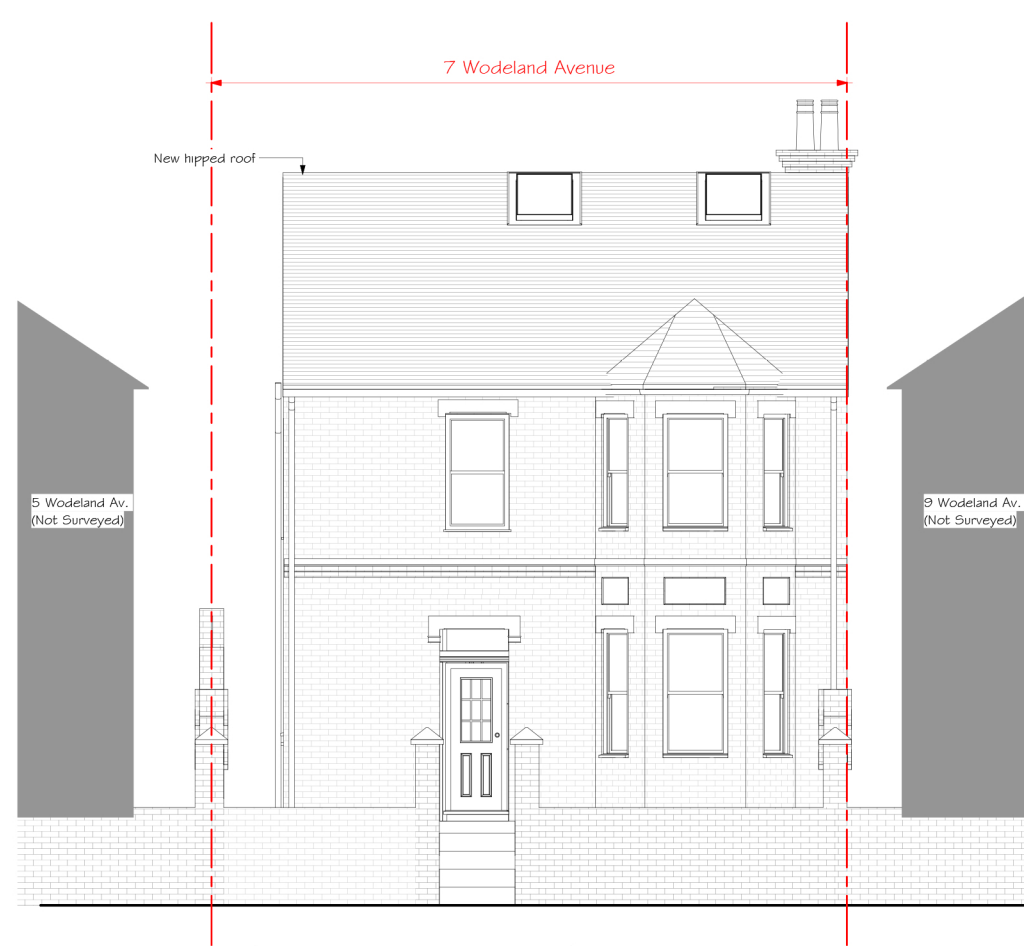
2 Proposed Front Elevation 1:100