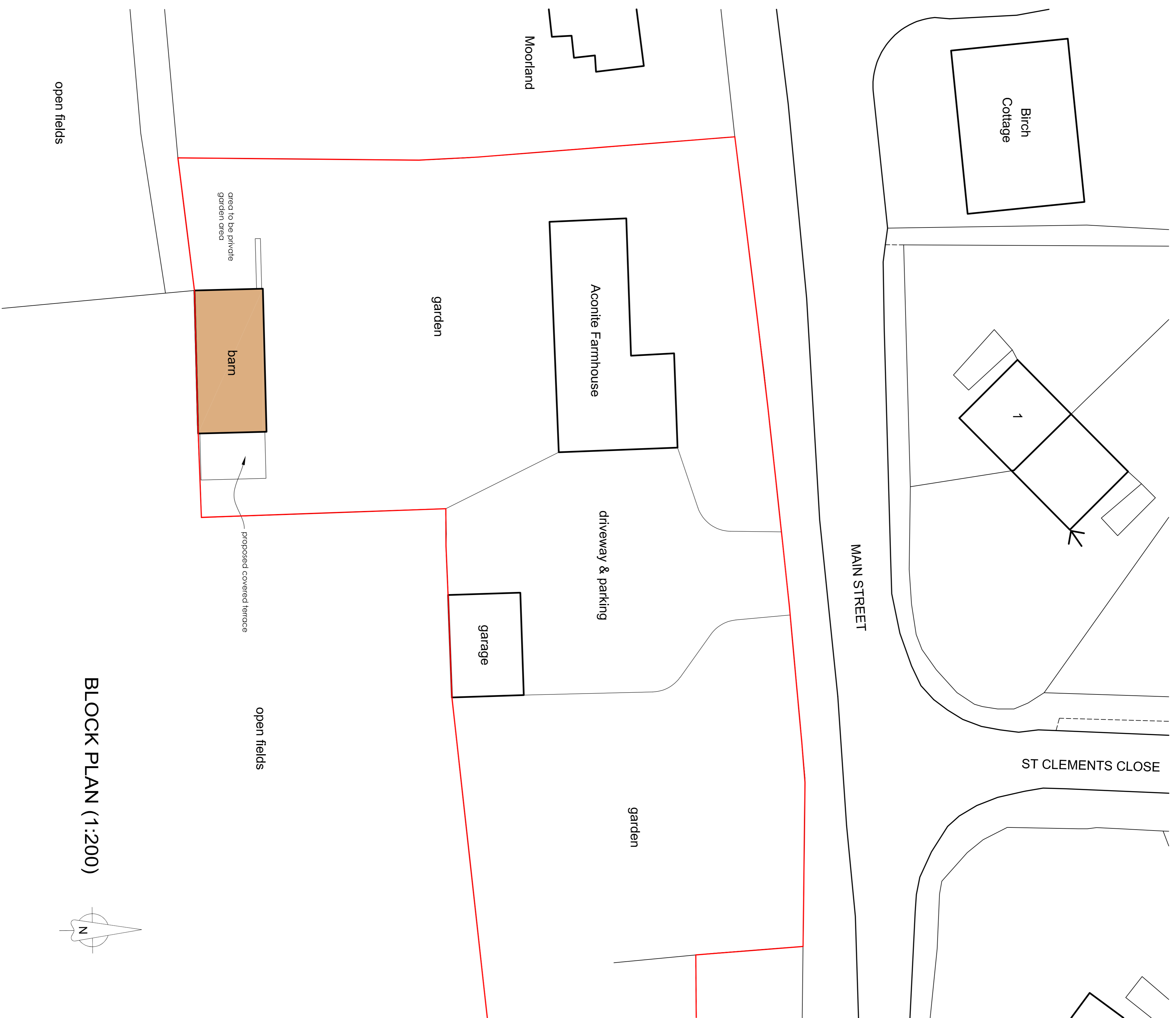
BLOCK PLAN (1:200)