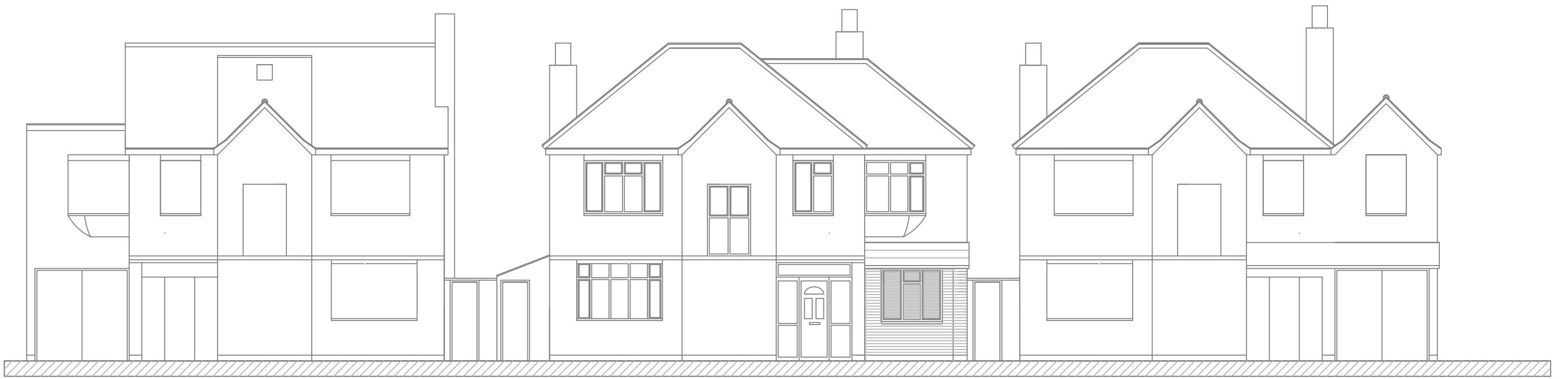
No. 11 PROPOSED FRONT ELEVATION No. 9 GROUND FLOOR RED BRICK TO MATCH EXISTING ROOF DK BROWN CONCRETE TILES WINDOWS WHITE UPVC No. 7