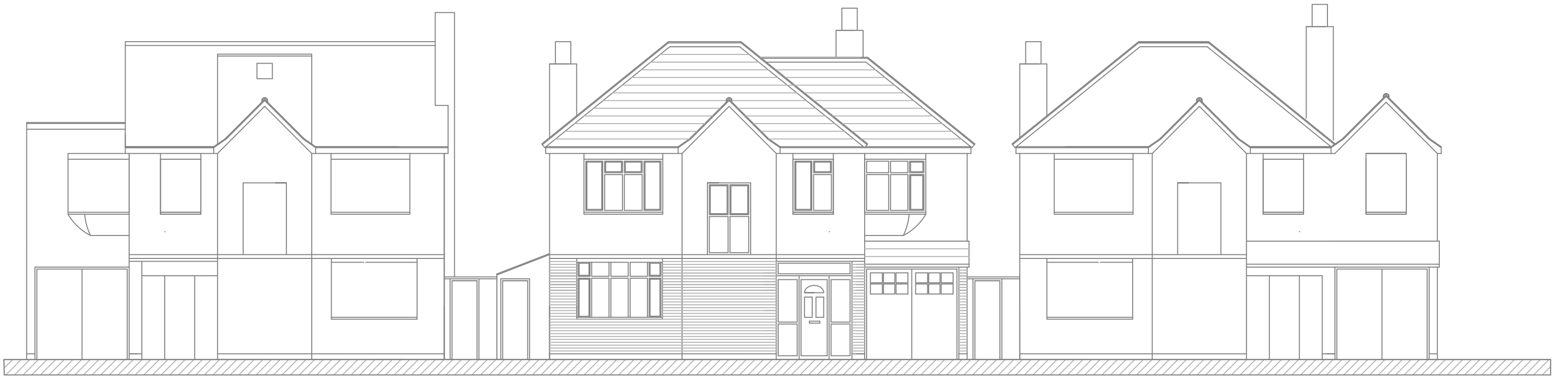
No. 11 GROUND FLOOR RED BRICK FIRST FLOOR WHITE RENDER ROOF DK TERRACOTA PLAIN TILES WINDOWS WHITE UPVC No. 9 GROUND FLOOR RED BRICK FIRST FLOOR WHITE RENDER ROOF DK BROWN CONCRETE TILES WINDOWS WHITE UPVC No. 7 GROUND FLOOR RED BRICK FIRST FLOOR WHITE RENDER ROOF DK BROWN CONCRETE TILES WINDOWS WHITE UPVC