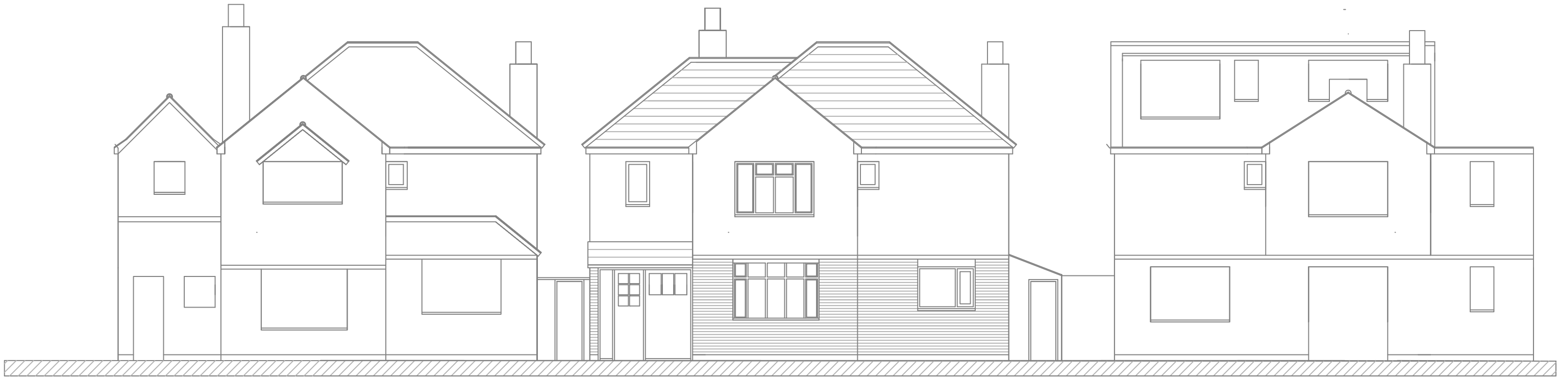
No. 7 GROUND FLOOR RED BRICK FIRST FLOOR WHITE RENDER ROOF DK BROWN CONCRETE TILES WINDOWS WHITE UPVC No. 9 GROUND FLOOR RED BRICK FIRST FLOOR WHITE RENDER ROOF DK BROWN CONCRETE TILES WINDOWS WHITE UPVC No. 11 GROUND FLOOR RED BRICK FIRST FLOOR WHITE RENDER ROOF DK TERRACOTA PLAIN TILES DK BROWN VERTICAL CLADDING WINDOWS WHITE UPVC