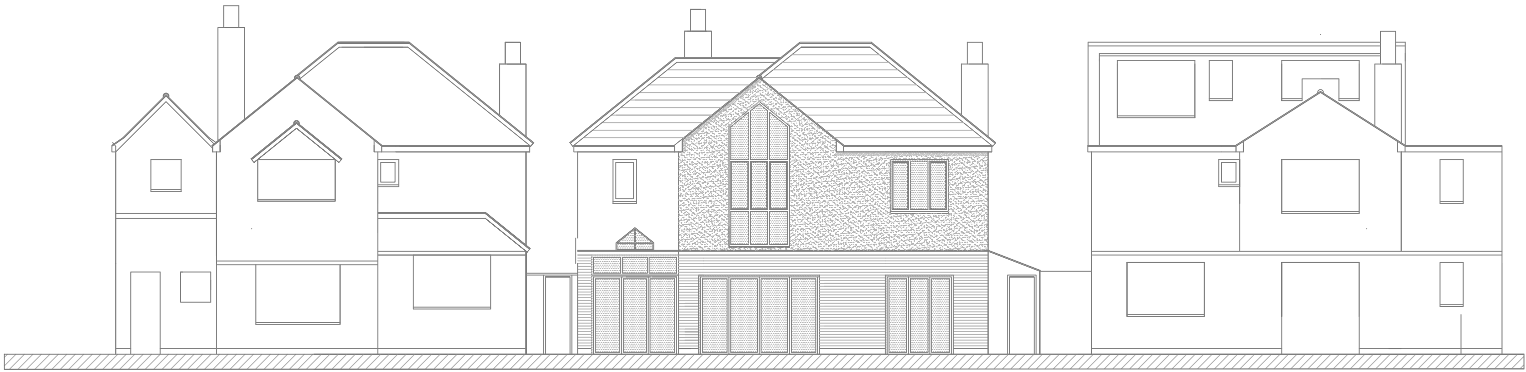
No. 7 PROPOSED REAR ELEVATION No. 9 GROUND FLOOR RED BRICK TO MATCH EXISTING FIRST FLOOR RENDER TO MATCH EXISTING BI-FOLD DOORS WHITE PPC ALUMINIUM WINDOWS WHITE PPC ALUMINIUM LANTERN WHITE PPC ALUMINIUM No. 11