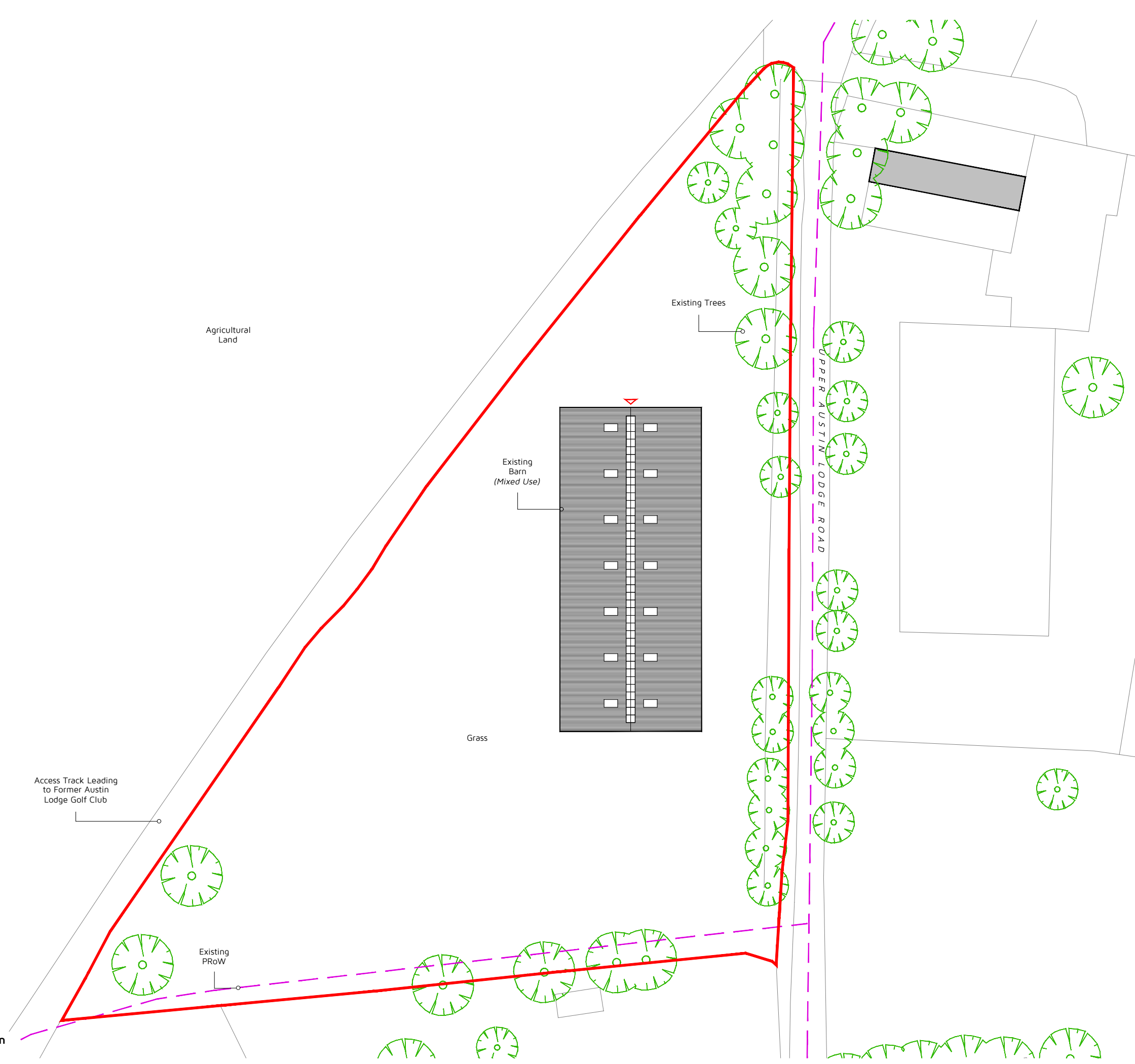
Existing Site Layout Plan 1:500 @ A3