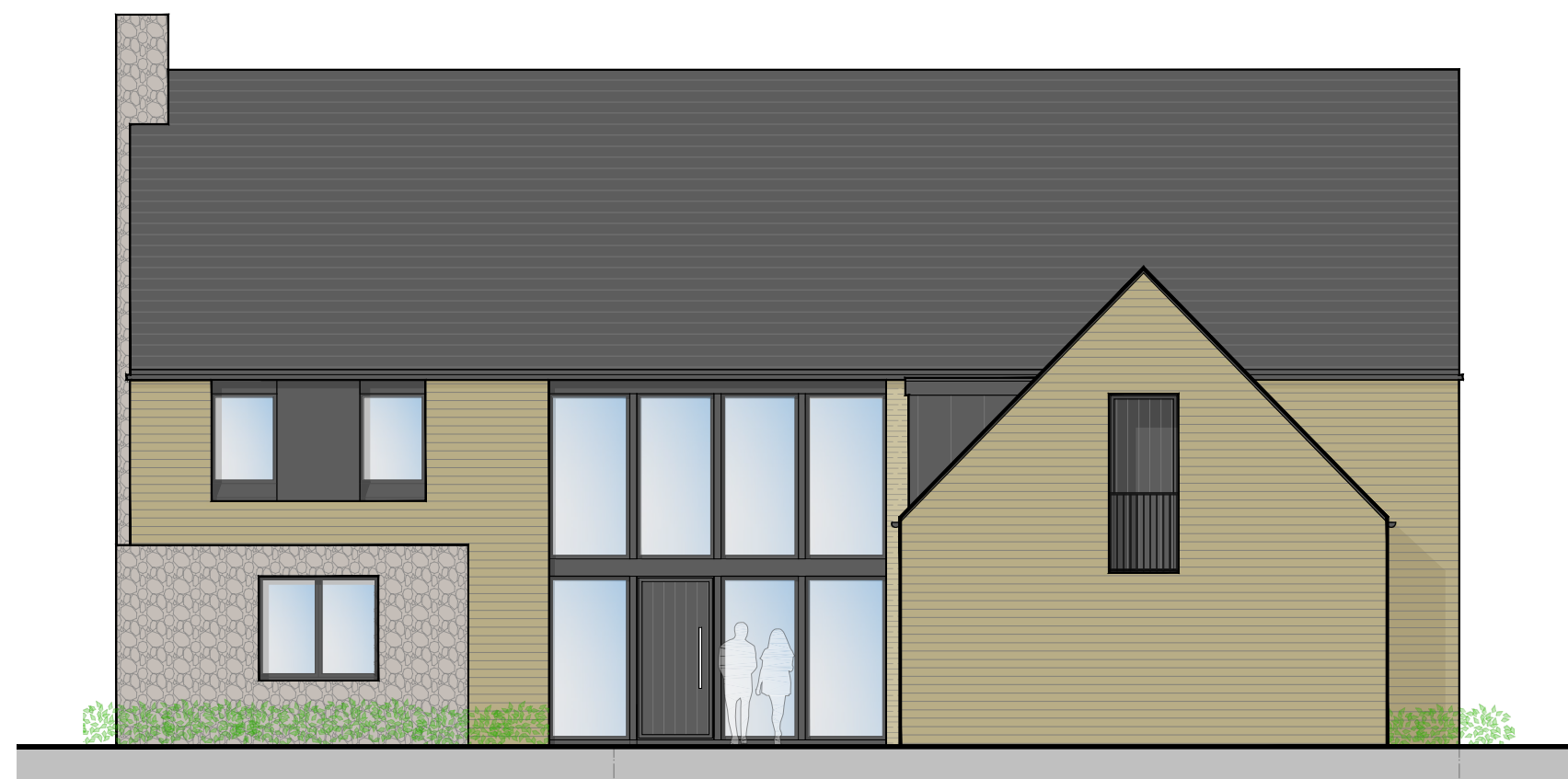
1. Proposed East Elevation 1:100 @ A2