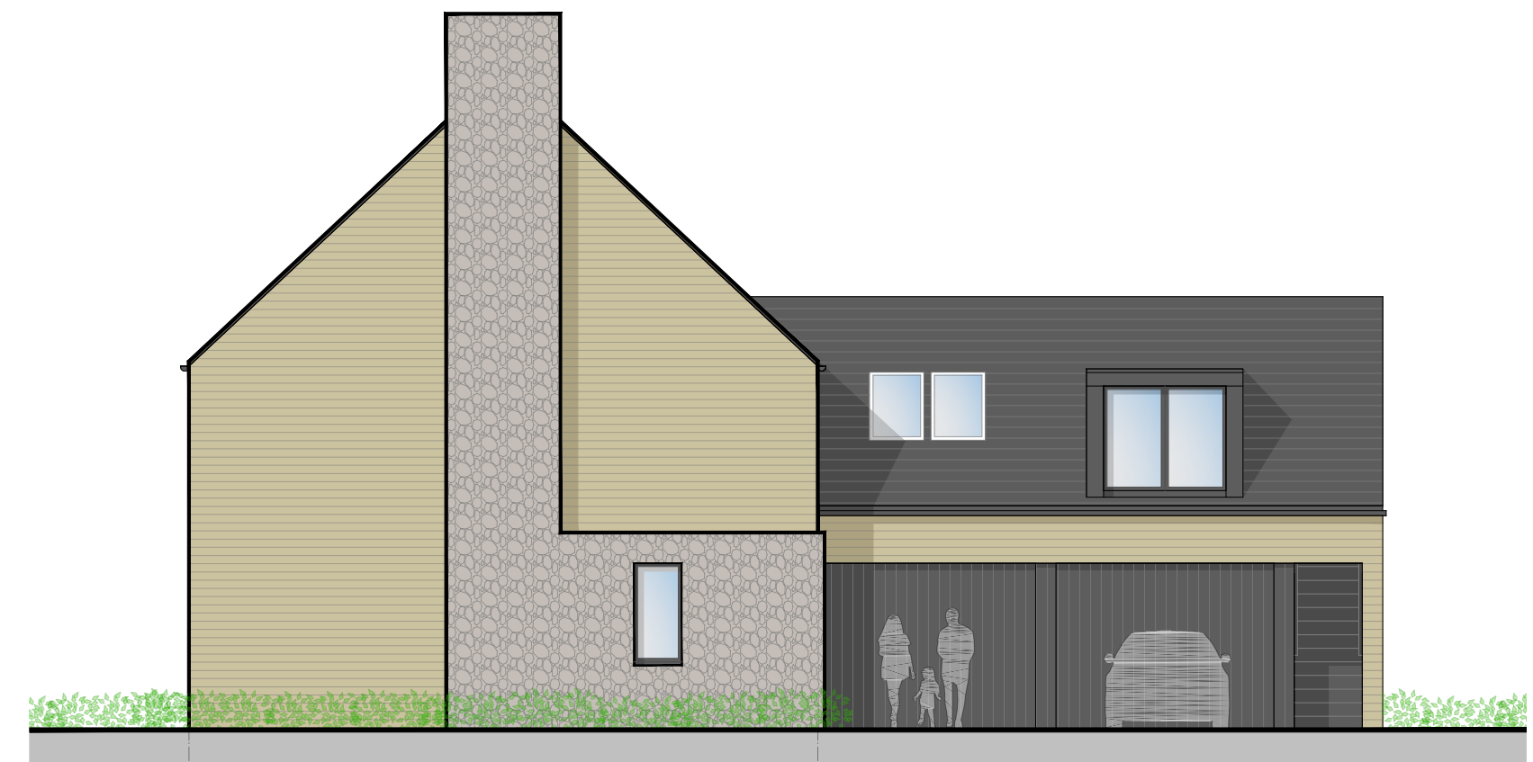
2. Proposed South Elevation 1:100 @ A2