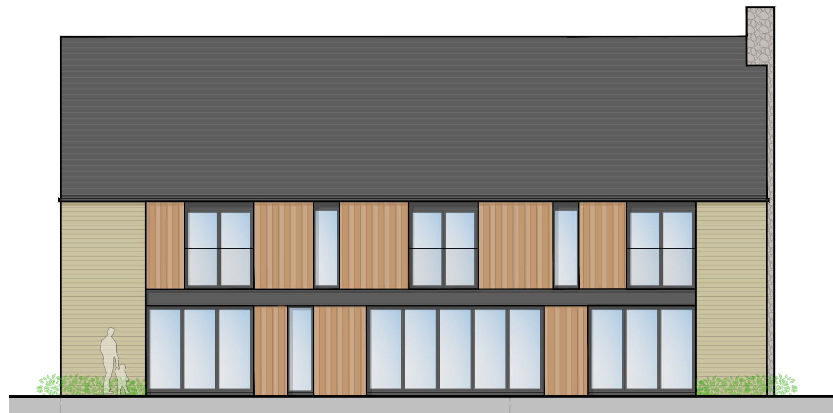
3. Proposed West Elevation 1:100 @ A2