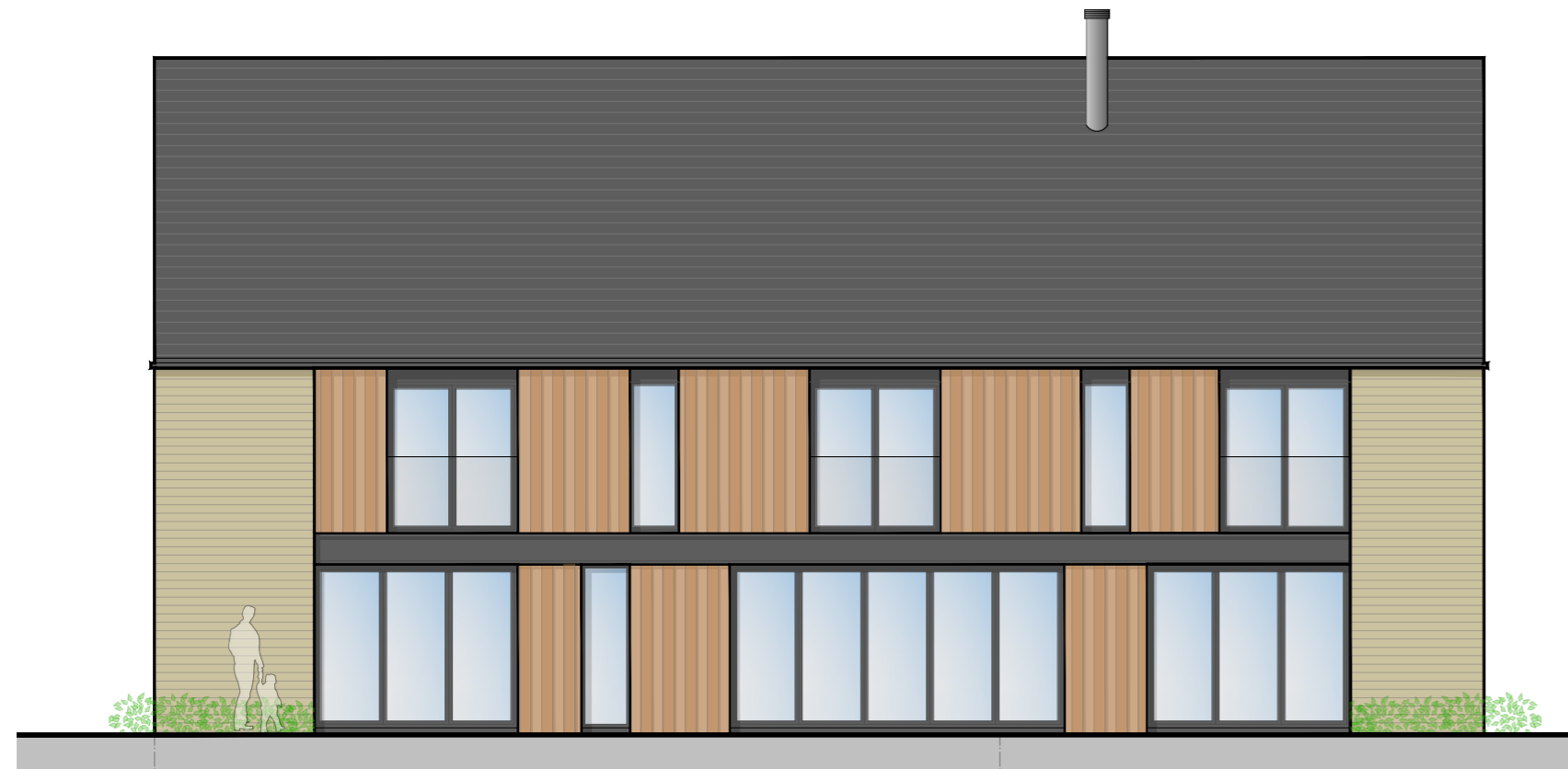
3. Proposed South Elevation 1:100 @ A2