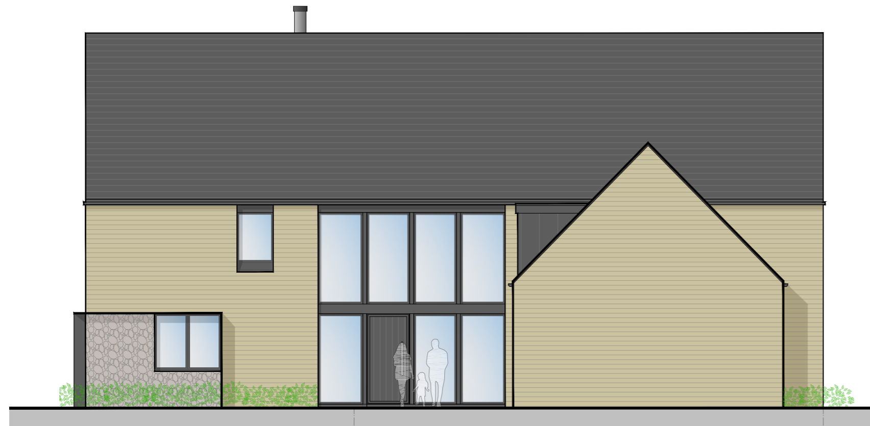
1. Proposed North Elevation 1:100 @ A2