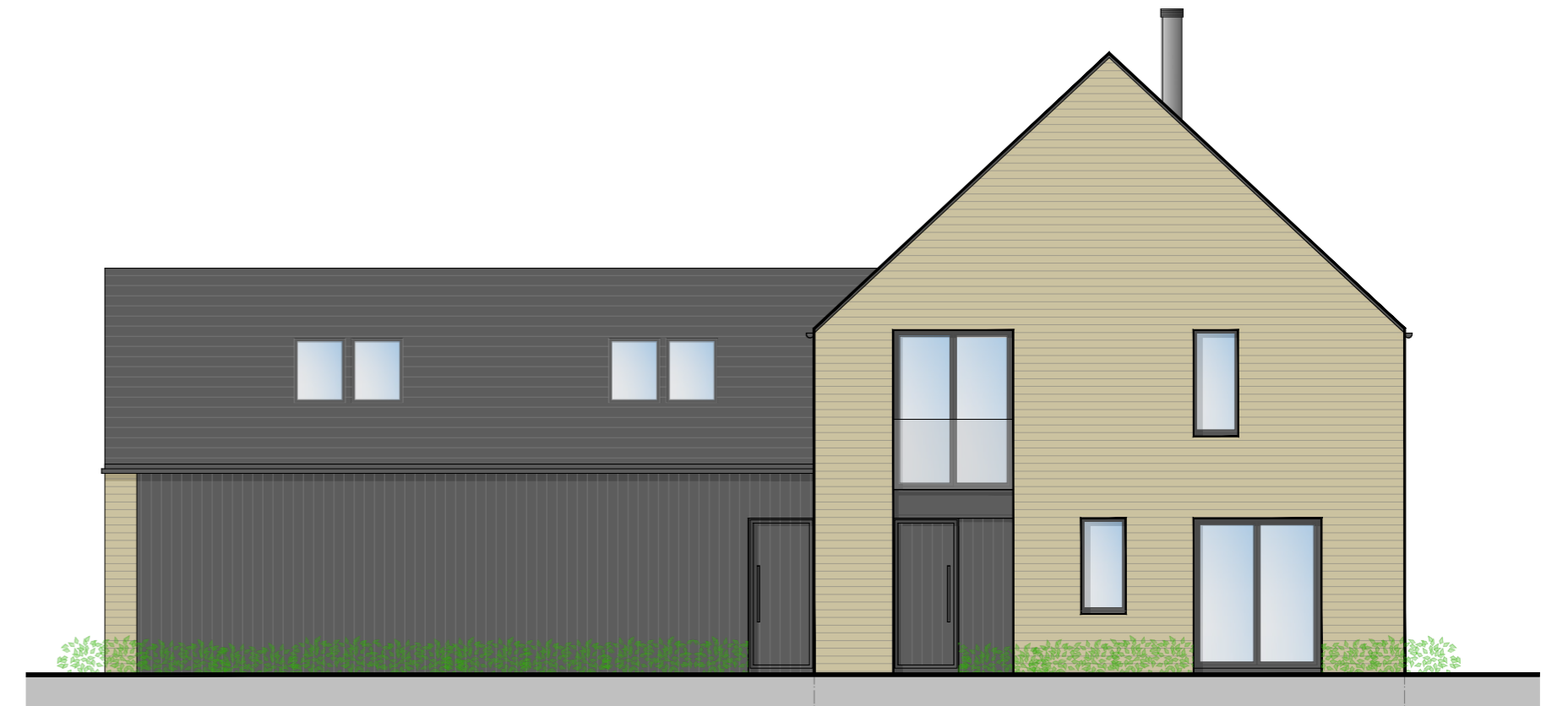
4. Proposed West Elevation 1:100 @ A2