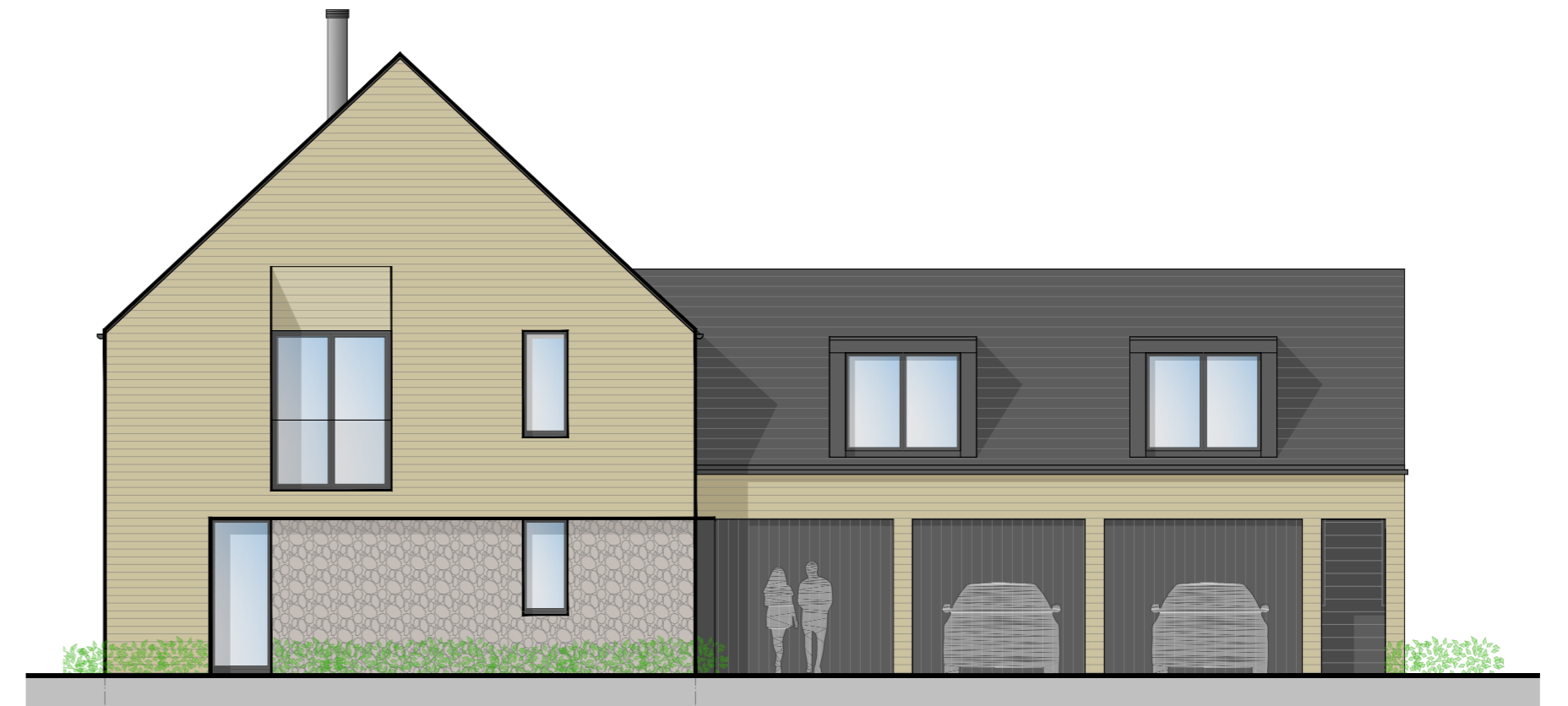
2. Proposed East Elevation 1:100 @ A2