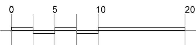
Scale in metres - 1:200 scale bar