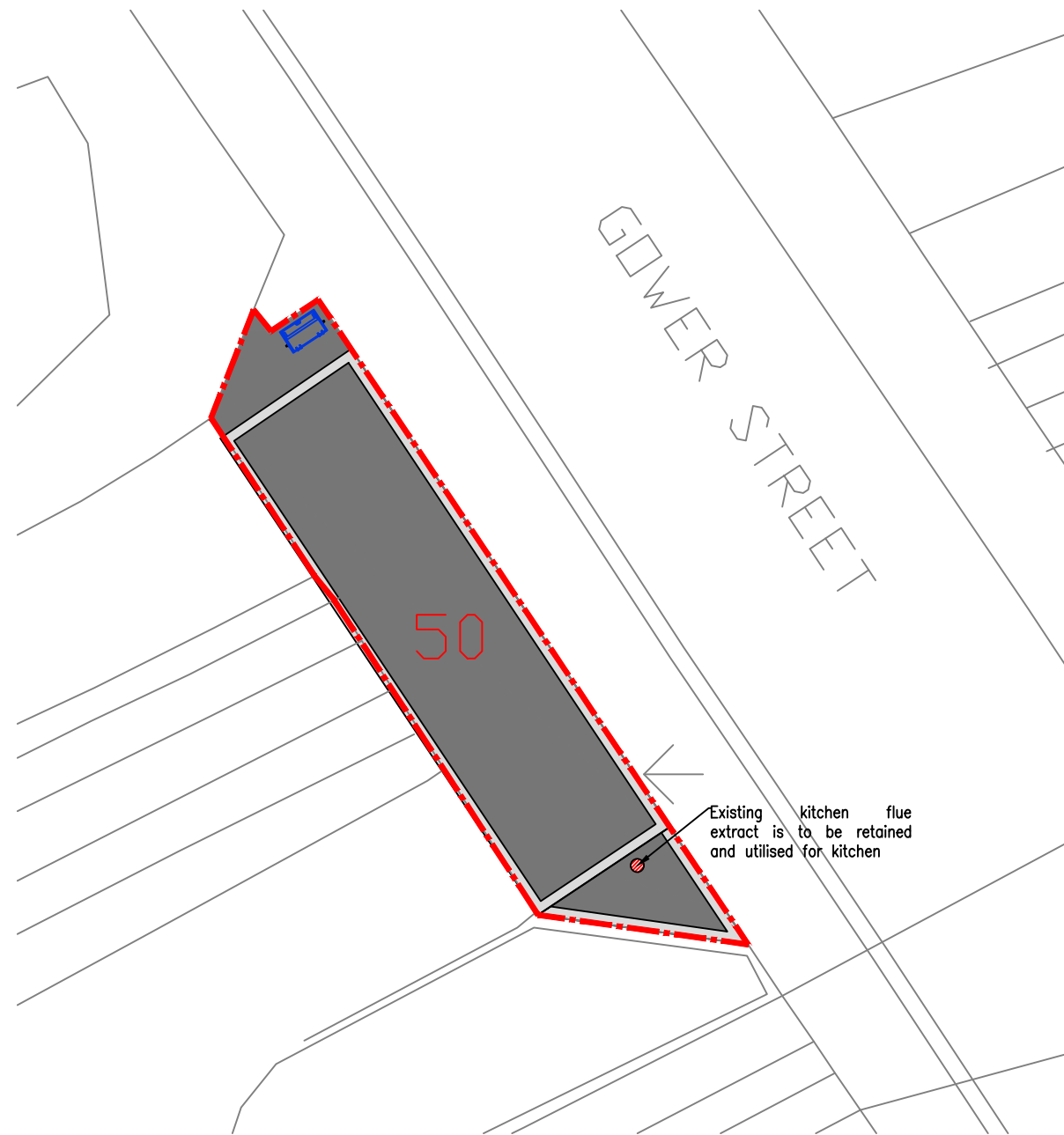
Block Plan 1:200