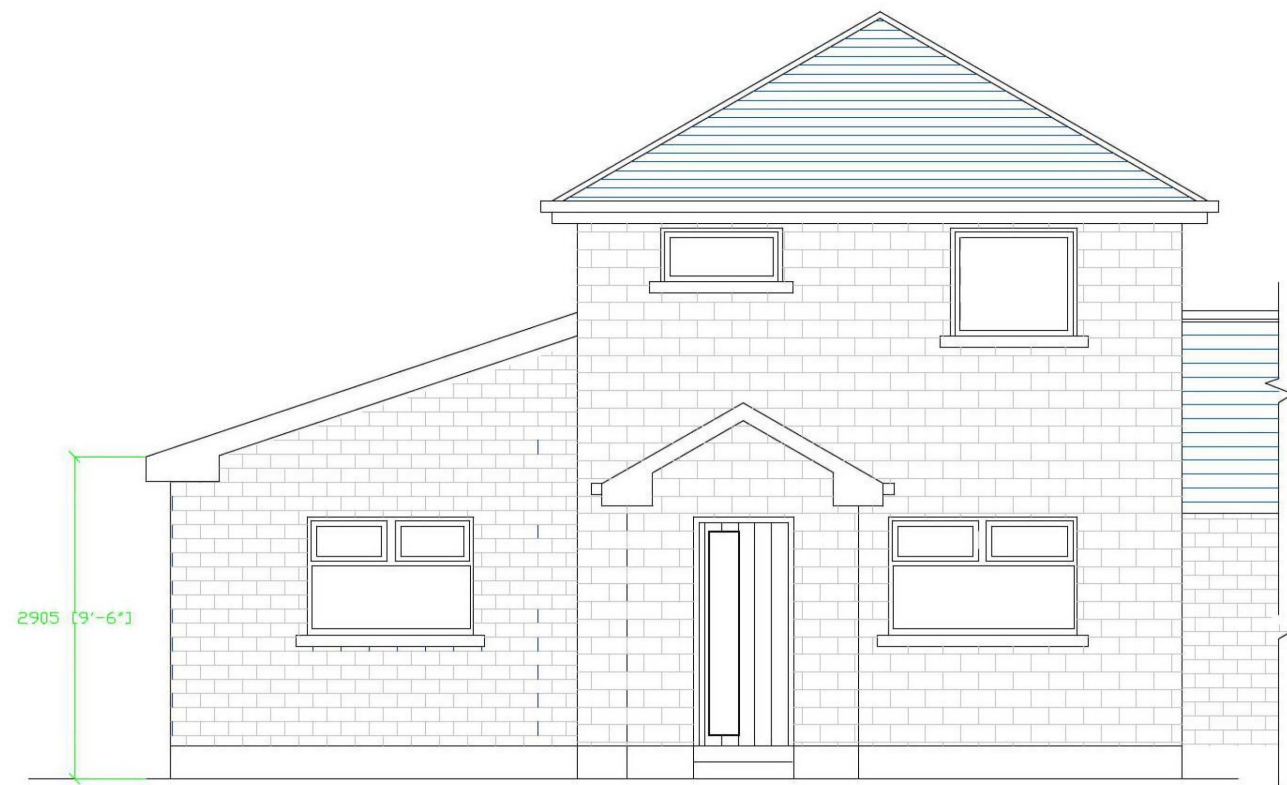
PROPOSED EXTENSION FRONT ELEVATION