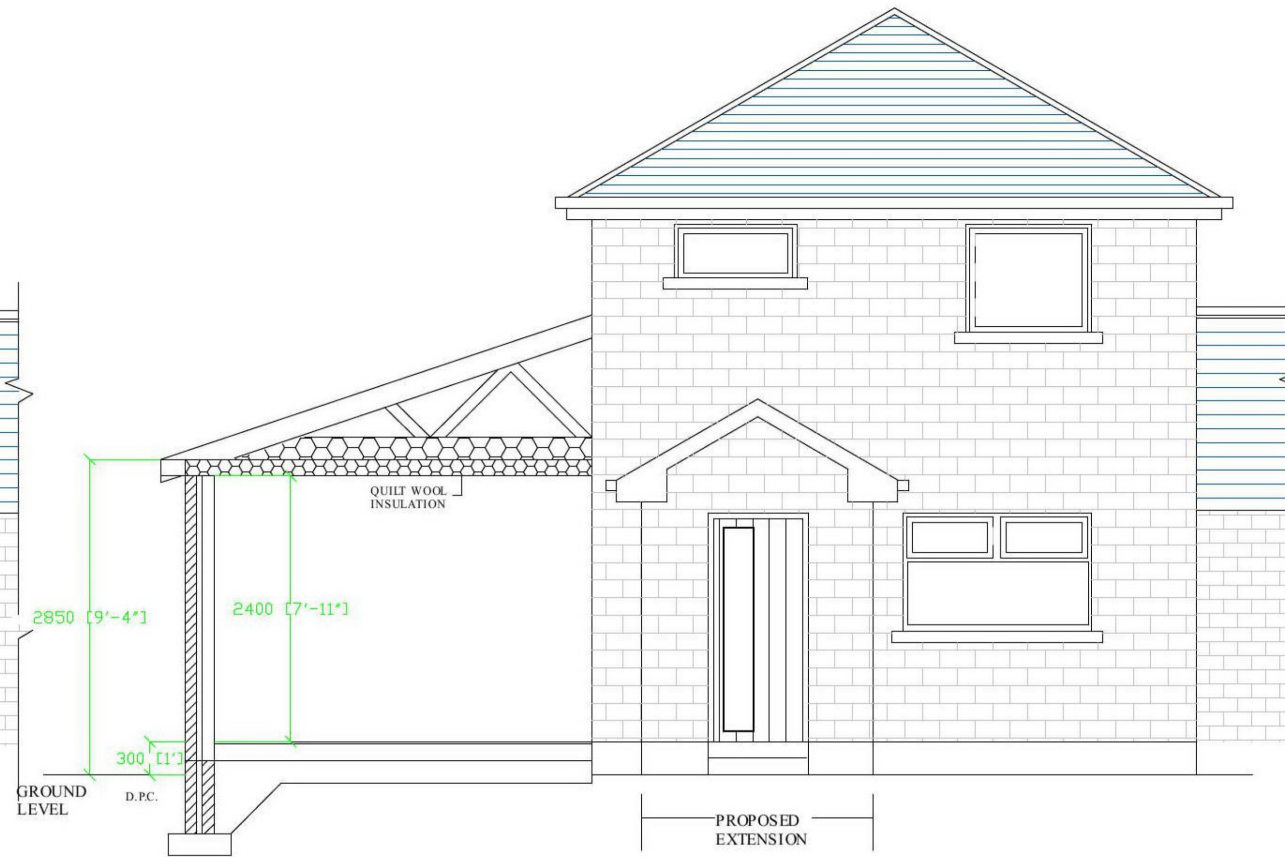
PROPOSED EXTENSION SECTION