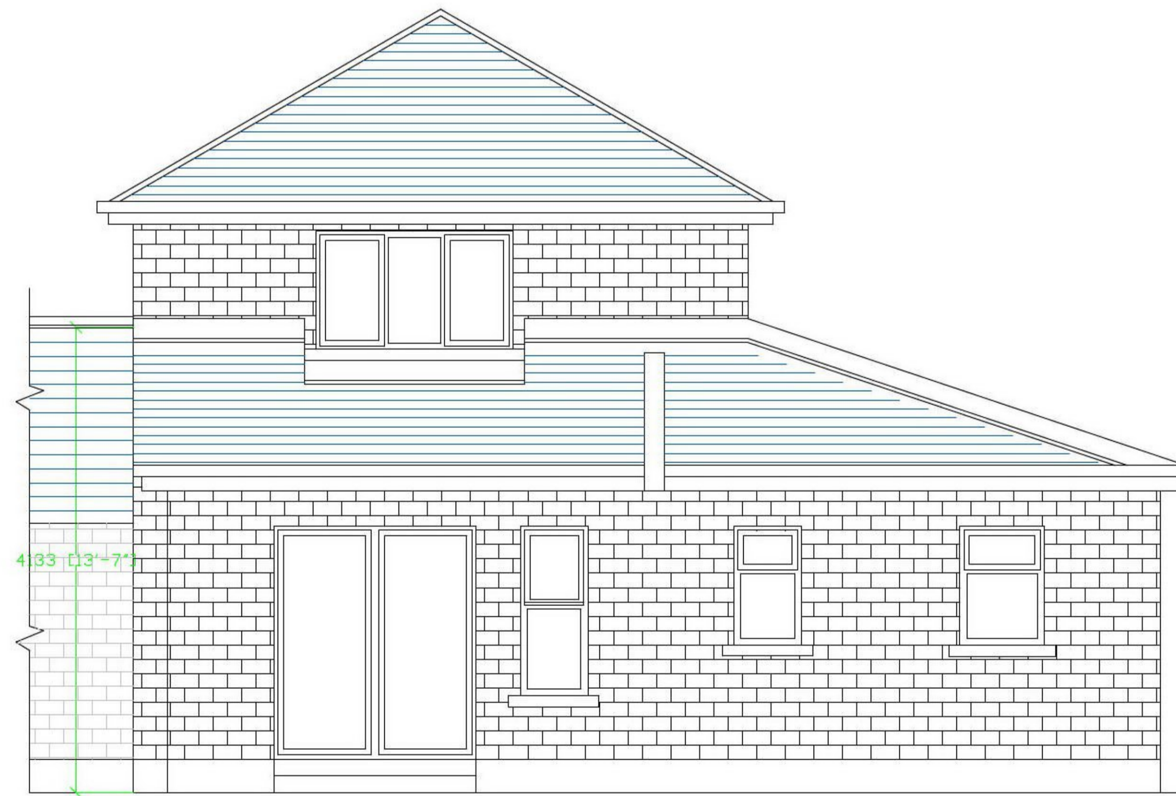
PROPOSED EXTENSION REAR ELEVATION