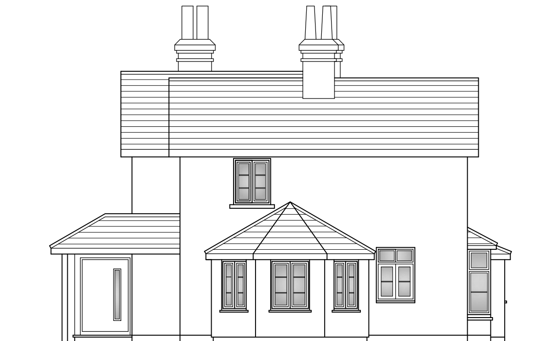
PROPOSED SE SIDE ELEVATION